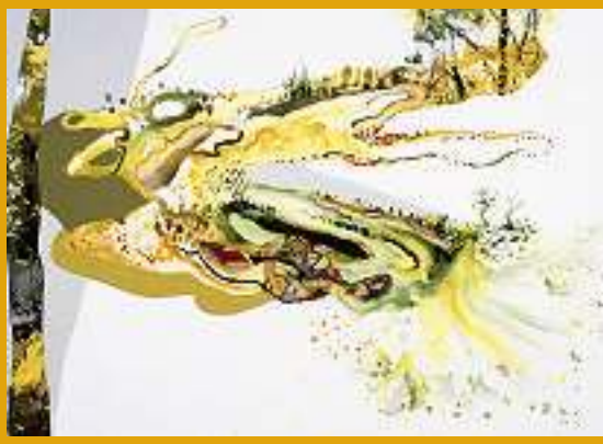
Sandy Litchfield, Plenty of Particulars , 2004. Oil, acrylic, ink, and vinyl emulsion on nylon on canvas. Courtesy the artist and Bernard Toale Gallery, Boston

New Turf upends conventional notions about the means by which we represent the landscape. This exhibition brings together 15 artists from Vermont and across the nation who draw inspiration from the rural, urban, and suburban environments around them. The American landscape has long exerted a strong pull on artists. These contemporary artists have distinguished themselves with thought-provoking, abstract works that make use of humor, politics, memory, and perception to evoke the rapidly changing American scene. Featuring works ranging from aerial photographs of environmentally impacted sites and pencil drawings charting the layout of suburban big-box stores to paintings offering rigorous, formal explorations of nature's light, color, space, and mood, New Turf maps the diverse terrain where landscape and abstraction meet.