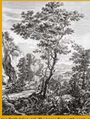
Jan Both (1619-52), The Large Tree , 17th century. Etching. Gift of William Marks, 1996.12

The splendors of nature have inspired Western artists since antiquity. It was not until the 16th century, however, that landscape gained acceptance as an independent genre, rather than merely an ancillary element in a larger composition. Since then, artists have focused their gazes on natural vistas, resulting in works that range from bucolic arcadias promising pleasure or solace to spartan locales laden with darker undertones. For many artists, the landscape offered an ideal field that could be freely infused with spiritual, philosophical, political, historical, or personal meanings.