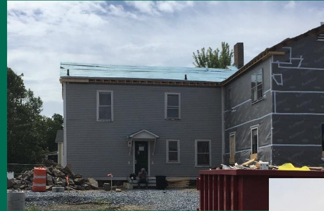
Wadhams House • Historic paint • Building envelope