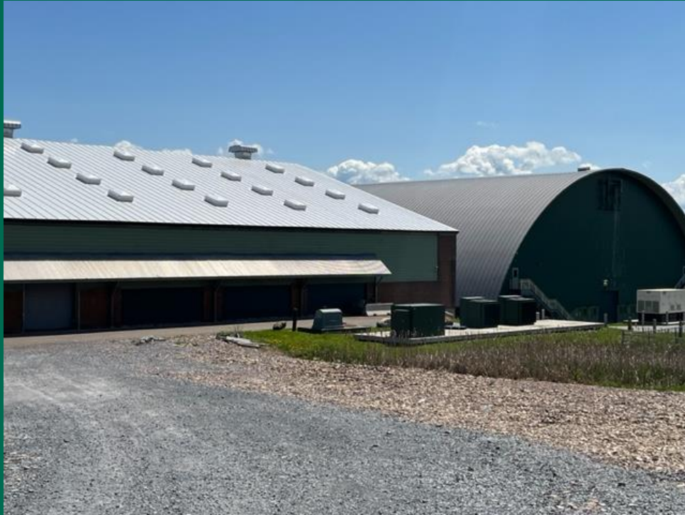
Replaced original 1981 roof on Multipurpose/Indoor Turf area