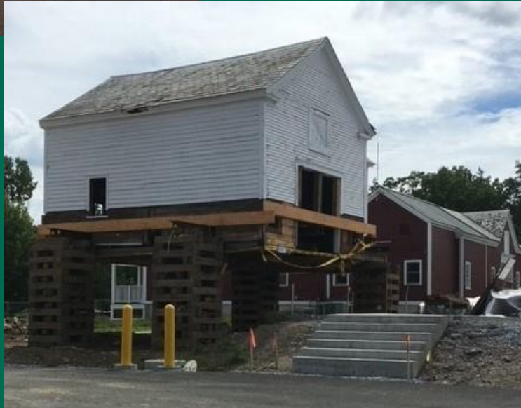
Wadhams Barn New foundation