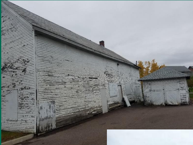
Pomeroy Barn & garage demolished