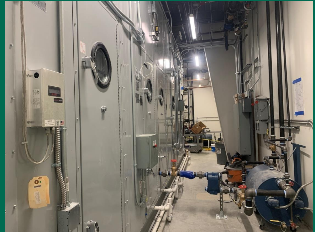
Replaced original 1980 pneumatic (air handling) unit with DDC (digital controls) to improve cooling and ventilation for Athletics Group Fitness Hub