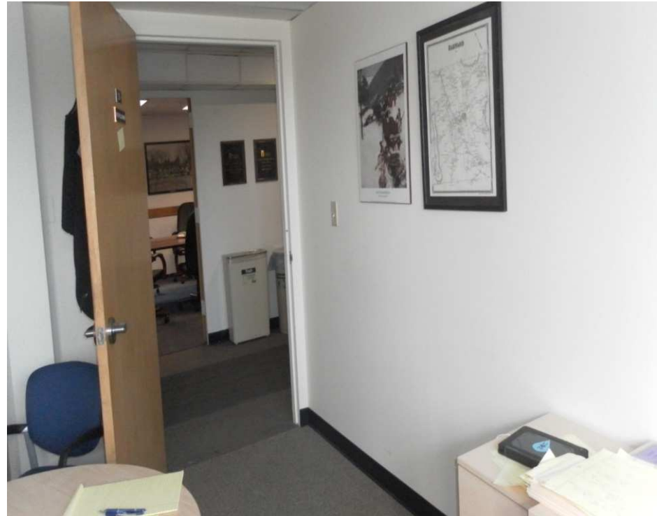
284 East Avenue- Divided One Large Office Into Two