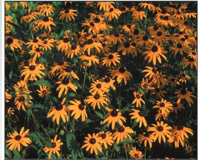
Clumps of flowers will attract more pollinators than individual plants.

Hummingbirds - Yellow, Orange, Pink, Purple, but mainly Red