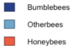
Who visits Vermont blueberries?