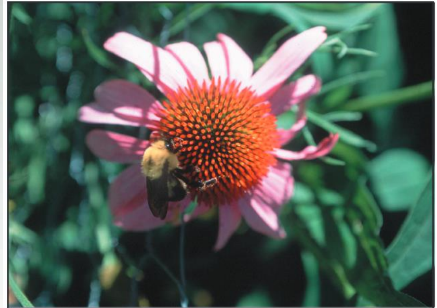
A bumblebee visits a purple coneflower.