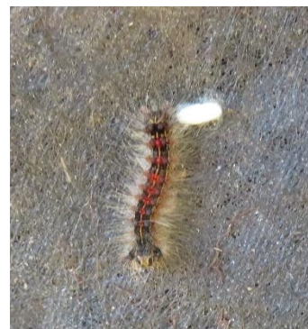
Adult male with feathered antennae; fungus-infected larva; virus-infected larva; larva parasitized by a wasp with the pupal case of the wasp attached (top to bottom).