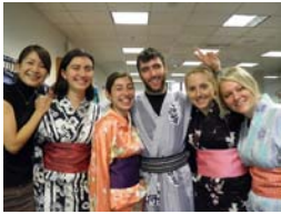
Japanese House hosted Mini Matsuri on Nov. 2, 2013, during which some students had a chance to be dressed in kimono.