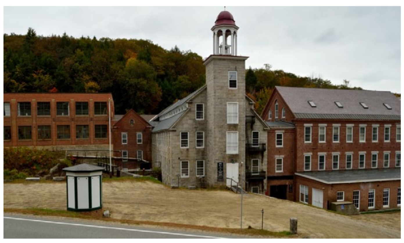
The historic mills in Harrisville, New Hampshire reflect the town's manufacturing and industrial history.