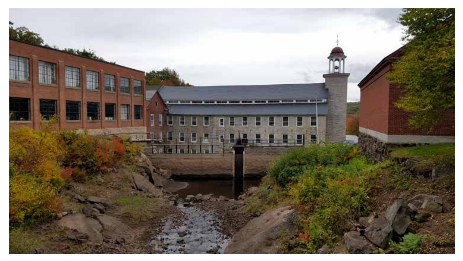
Cheshire Mills, the centerpiece of Historic Harrisville's industrial mill complex.