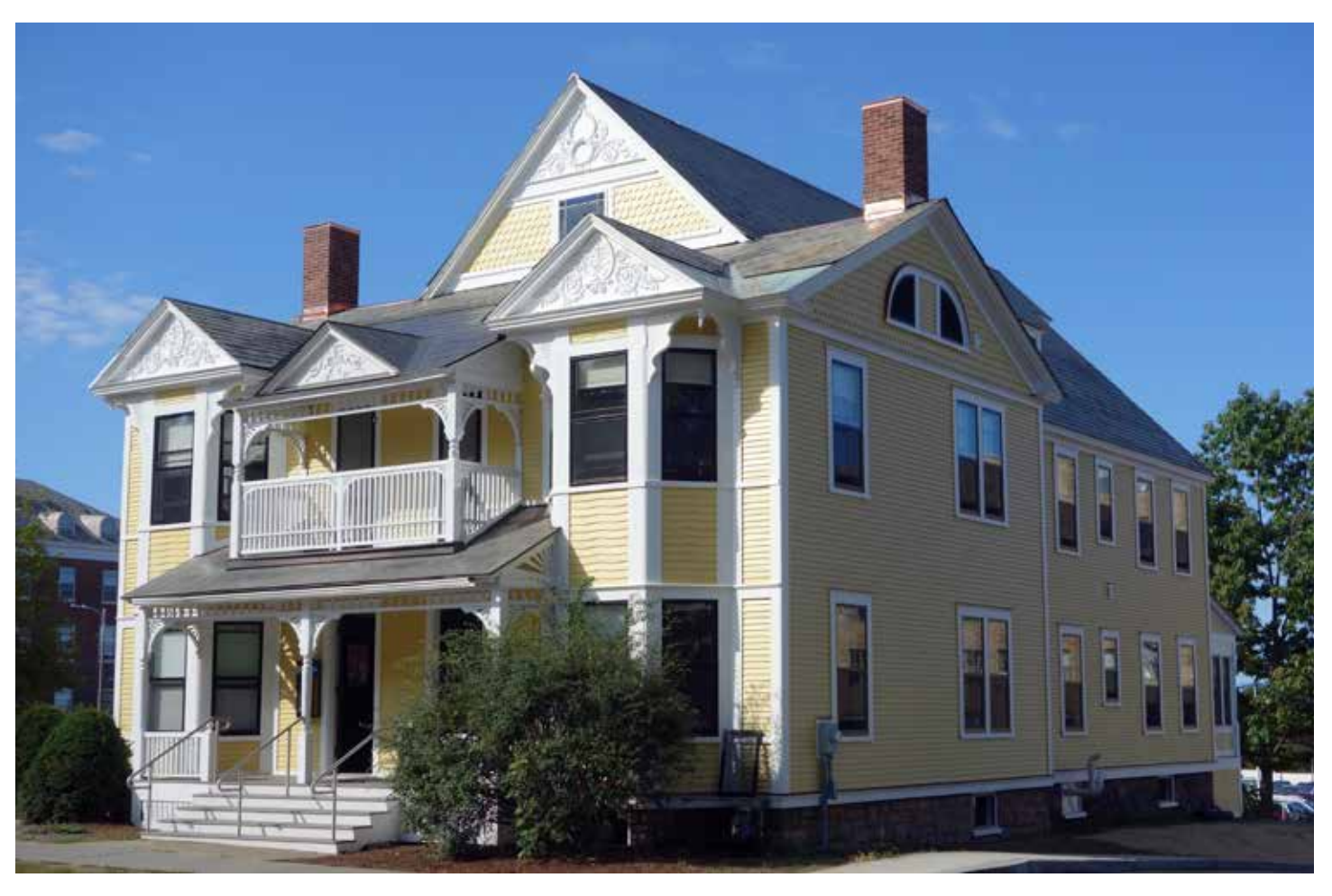
Nicholson House after restoration

Long covered with white aluminum siding, the exterior of the historic Nicholson House on the University of Vermont campus has been restored to its historic colors with research assistance by UVM historic preservation students and faculty. At the request of the UVM Physical Plant, students in Professor Visser's Architectural Conservation I course sampled accessible exterior surfaces as a class project. By examining numerous cross-sections of paint samples under digital and UV microscopes in the UVM Historic Preservation Lab, they determined that the base coat of paint on the clapboards was originally a yellowish ivory, trim and porch