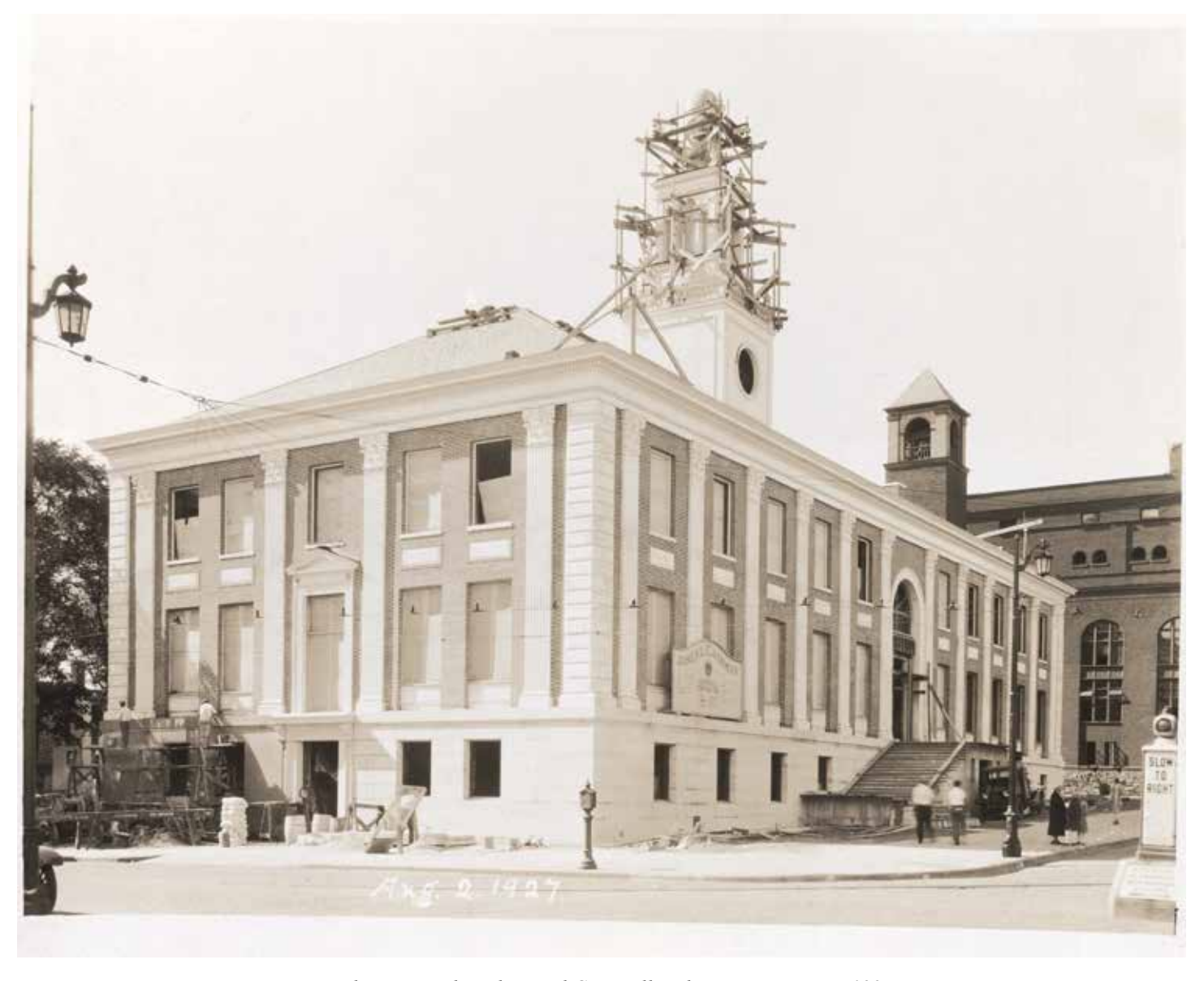
Burlington's colonial revival City Hall under construction in 1927