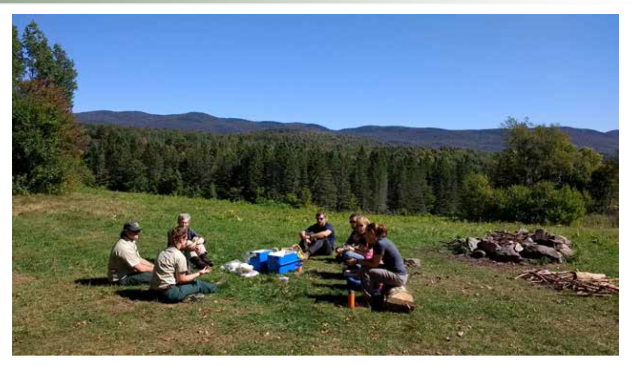
The second-year class enjoying lunch on a field trip to the Green Mountain National Forest

Historic Preservation Program Department of History • Wheeler House 133 South Prospect Street University of Vermont Burlington, Vermont 05405