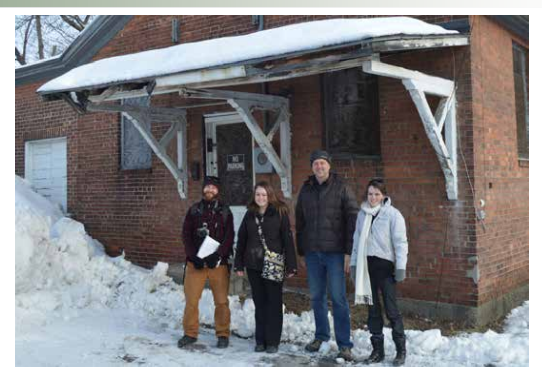
Second-year students braved the January cold to create a Rehabilitation Investment Tax Credit (RITC) proposal for the Union Cooperative Store Bakery in Barre, Vermont.

Historic Preservation Program Department of History • Wheeler House 133 South Prospect Street University of Vermont Burlington, Vermont 05405