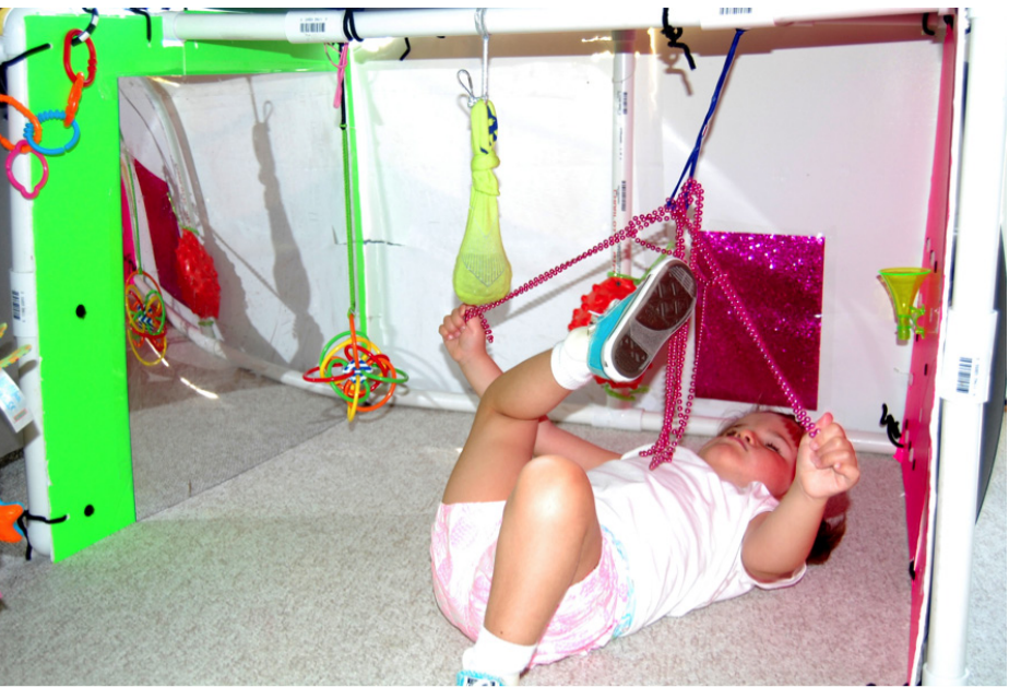
Figure 7: A young girl lies on her back inside a three sided structure with a clear plastic ceiling (Little Room). There are beads hanging down from the ceiling and the girl is grasping at the beads with her hands and kicking the beads with one foot.

7. Set up the environment by adding items to encourage children to explore through their sense of touch.