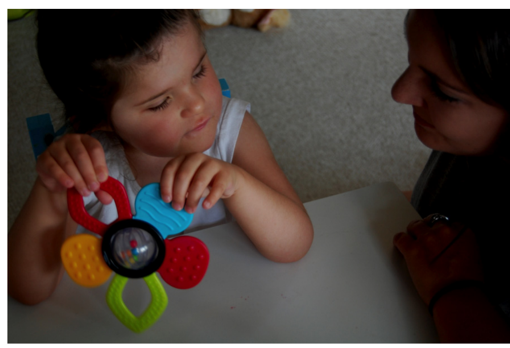
Figure 1: Young girl sitting at a table with her intervener. The girl is exploring a flower shaped textured toy (bumpy, smooth, etc...) with her hands while her intervener watches her hands and smiles in a way that shows that she can see what the girl is interested in.