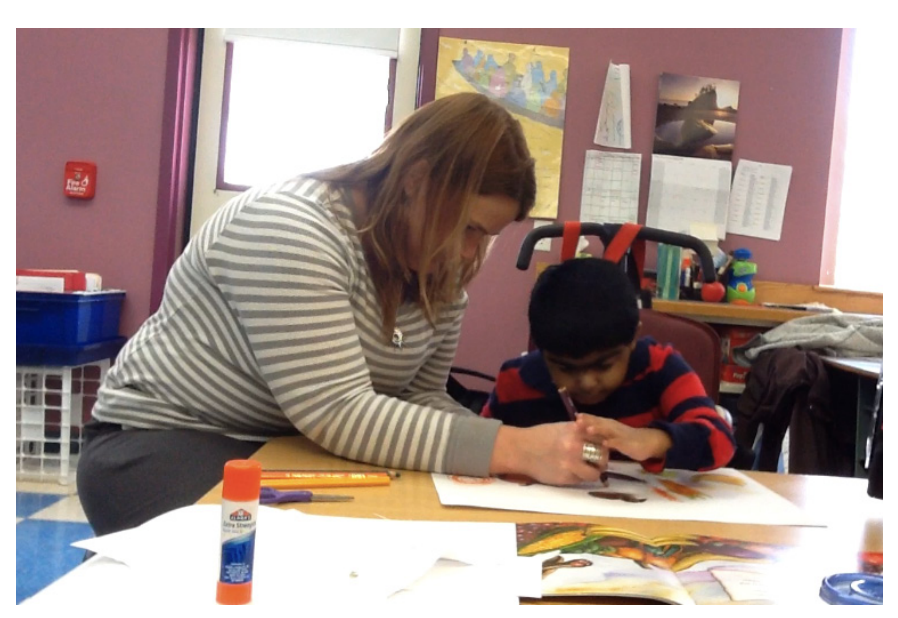
Figure 10: An intervener and a young boy are sitting at a table in the classroom. He has placed his hand on hers as she draws with a pen. He is "watching" her as she does an art activity. She is showing him how she does it.

Over time, the child will likely want to do the activity himself. Children who can see have the opportunity to see others doing things. Children who are deafblind need a similar opportunity to "see" actions before being invited to do these actions themselves.