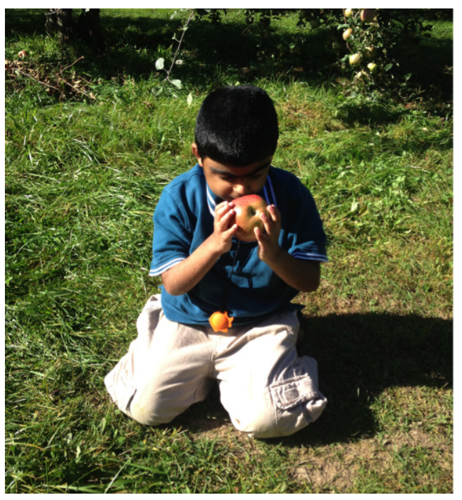
Figure 2: Young boy is sitting outside in the grass on his knees. He is holding an apple with both of his hands and the apple is touching his nose and his lips.

This boy is deafblind and he is interested in the apple, which you can see by looking at his hands.