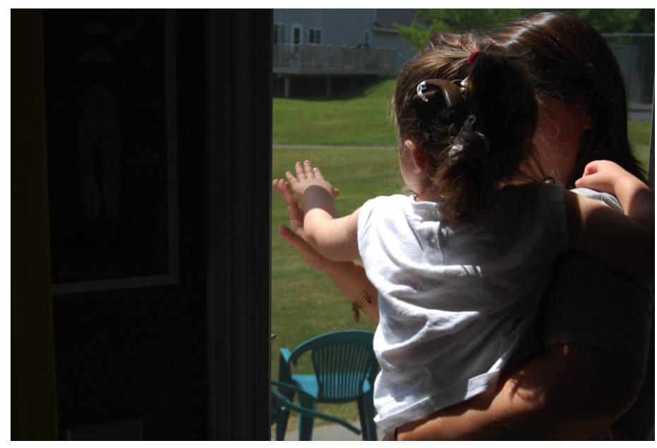
Figure 9: A young girl and her intervener are standing at the door. The young girl is in the arms of her intervener. The girl is watching (and maybe helping) her intervener open the screen door. The girl's hand is free, on top of her intervener's.

9. It is easy to show a child with deafblindness what you are doing if you invite them to follow along with your hands while you do things.