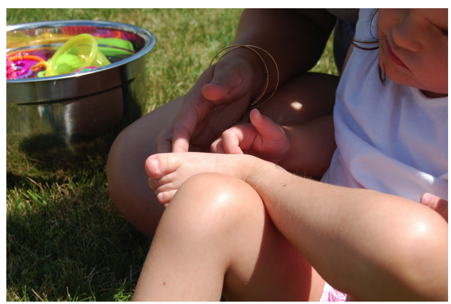
Figure 8: A young girl is sitting outside on the grass with bare feet. She is sitting in front of her intervener and is using her right hand to feel and scratch the bottom of her left foot. The intervener is touching her foot also as if to say, "I see you are exploring your foot." After sharing this experience, the intervener might sign, "foot," or "scratch foot."

Figure 7: A young girl lies on her back inside a three sided structure with a clear plastic ceiling (Little Room). There are beads hanging down from the ceiling and the girl is grasping at the beads with her hands and kicking the beads with one foot.