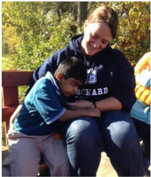
Figure 3: A boy is sitting on a bench beside his intervener. He is leaning toward her, with his hand on her leg. He seems to have discovered her beside him.

3. It is important to be respectful when beginning tactile interactions. The ideal situation is when the child touches first. Then he is learning to reach out to the world. To let the child know of your presence, you can sit close to the child and wait for the child to discover you.