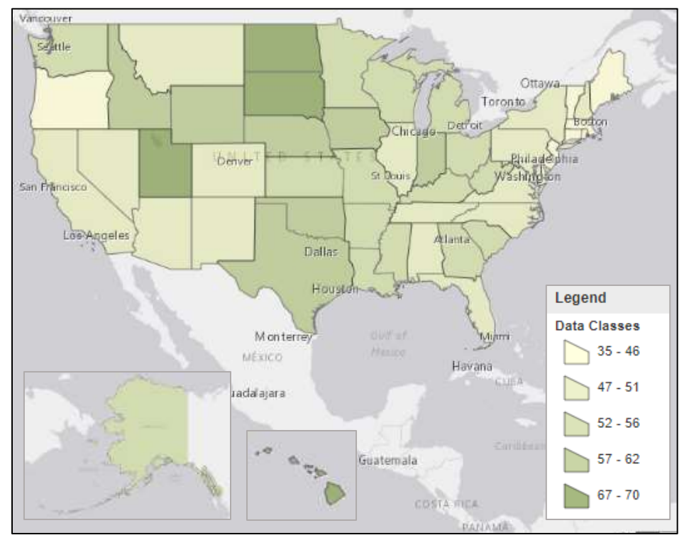
2016 Factfinder map