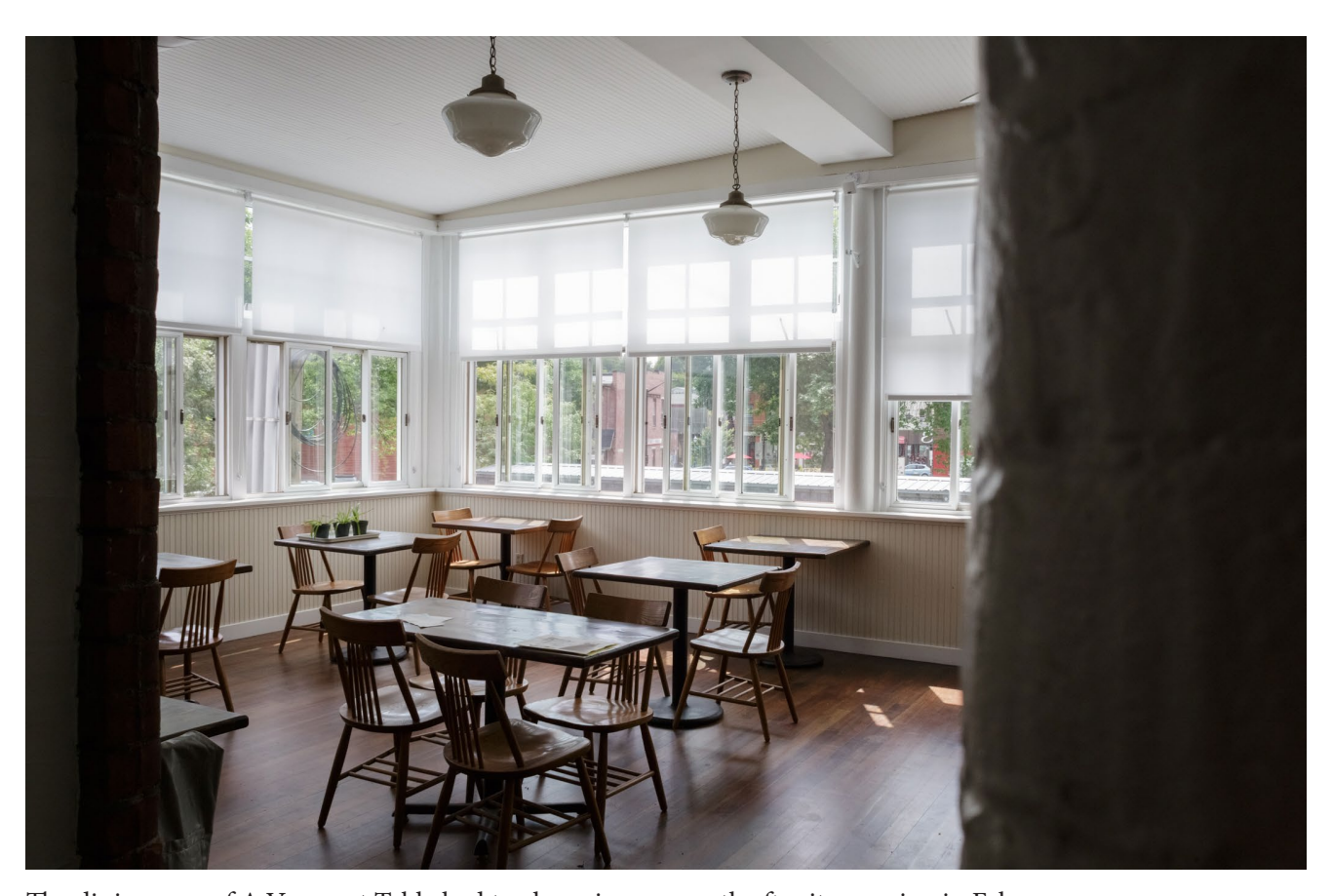
The dining area of A Vermont Table had to close since a month after its opening in February.