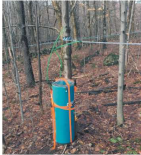
FIGURE 1. Study tree showing dropline and vacuum chamber for sap collection.