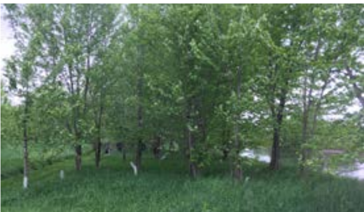
The site with mature trees in 2017.