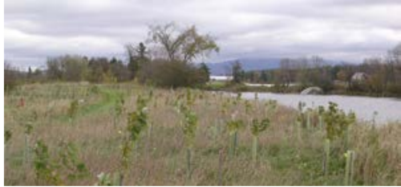
A riparian forest restoration site in Vermont. The site shortly after planting in 2005.