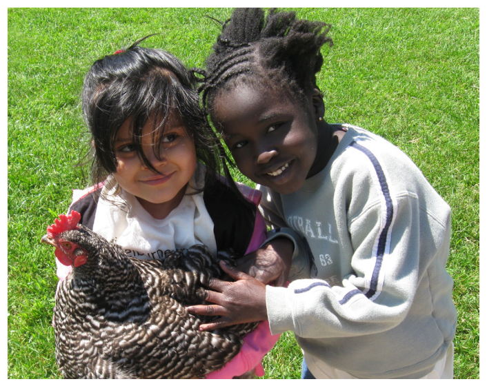
Summer Farm Camp, Shelburne Farms, Shelburne, VT