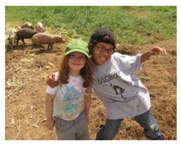
Full Moon Farm, Hinesburg, VT

For community-oriented farms such as CSAs, camps are a good way to strengthen connections with families. When kids have fun at your farm, it builds customer loyalty and the return on investment is long-term. Some farmers find that spending time with kids is a nice change of pace, and they may be comfortable taking a loss or merely breaking even because it improves quality of life. Others want their camp to be profitable, like any sound business. Regardless of your financial goals, all farmers need to employ careful planning and budgeting to develop a camp. Remember, always track your spending.