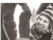
4-H &amp; YOUTH