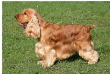
English Cocker Spaniel