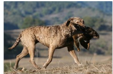
Chesapeake Bay Retriever