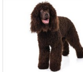
Irish Water Spaniel