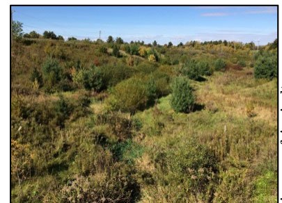
VT Agency of Agriculture