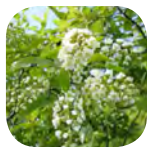
Aronia arbutifolia - Red Chokeberry April. Erosion control. Tolerates clay.

soil wet moist dry full sun part sun/shade full shade no pref. z: zone h: height s: spread