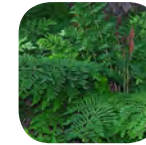
Osmunda regalis - Royal Fern Forms clusters. Full sun if kept moist.

z: 4 h: 3'-6' s: 2'-3' ☀️ ☀️ ☀️ ☀️ 🌱 🦌 🌸 🍂 💧