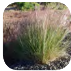
Aristida purpurea - Purple Threeawn May-September. Dry soils.

z: 3 h: 1'-3' s: 1'-1.5' ☀️ ☀️ ☀️ 🌱 🌸 🦌 🏠