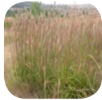
Andropogon gerardii - Big Bluestem September-February. Erosion control. Cut to ground in spring. Winter interest.

z: 4 h: 4'-6' s: 2'-3' ☀️ ☀️ ☀️ 🌱 🌸 🦌 🍂 ❄️