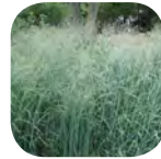
Panicum virgatum - Switchgrass July-February. Erosion control. Salt Tolerant. Clumping.

z: 4 h: 4'-6' s: 2'-3' ☀️ ☀️ ☀️ 🌱 🌸 🦌 🍂 ❄️