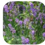
Schizachyrium scoparium - Little Bluestem. August-November. Salt tolerant. Erosion control. Purpleish.

z: 3 h: 1'-3' s: 1'-1.5' ☀️ ☀️ ☀️ 🌱 🌸 🦌 🏠