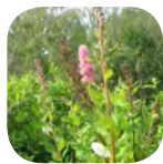
Spiraea tomentosa - Steeplebush July-September. Mound form.