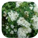
Spiraea alba - Meadowsweet Long blooms midsummer.