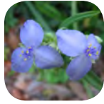
Tradescantia virginiana - Spiderwort August-September. Acidic.

z: 4 h: 1.5'-3' s: 1'-3' ☀️ ☀️ ☀️ ☀️ 🌱 🌸 🦌 💧