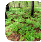
Polystichum acrostichoides - Christmas Fern. Evergreen. Erosion control. Full sun if moist

z: 3 h: 3'-5' s: 1'-2' ☀️ ☀️ ☀️ ☀️ 🌱 🍂 🌸