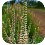
Veronicastrum virginicum - Culver's Root June-July. Rain gardens.