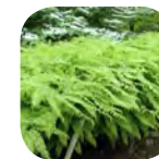
Adiantum pedatum - Maidenhair Fern Groundcover.

z: 3 h: 2'-4' s: 1'-2' ☀️ ☀️ ☀️ ☀️ 🌱 🦌 🌱