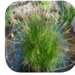
Carex stricta - Tussock Sedge May-June. Nesting habitat.

z: 4 h: 1.5'-3' s: 1'-3' ☀️ ☀️ ☀️ ☀️ 🌱 🌸 🦌 💧