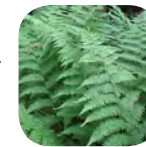
Thelypteris noveboracensis - New York Fern. Groundcover. Grow in tufts.

z: 4 h: 2'-4' s: 1'-2' ☀️ ☀️ ☀️ ☀️ 🌱 🌸 🦌 🌱