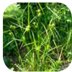
Carex grayi - Gray Sedge May-October. Salt tolerant.

z: 3 h: 2'-3' s: 2'-3' ☀️ ☀️ ☀️ ☀️ 🌱 💧 🌸 🏠