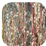
Salix discolor - Pussy Willow April-May. Erosion control.