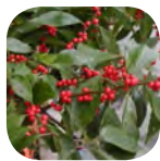
Ilex verticillata - Winterberry June-July. Erosion control.