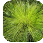
Carex vulpinoidea - Fox Sedge. July-August. Clumping. Erosion control.

z: 3 h: 1'-3' s: .5'-2' ☀️ ☀️ ☀️ ☀️ 🌱 🦌 💧