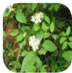
Cornus sericea - Red Osier Dogwood May-June. Erosion control. Spreads.