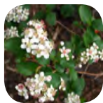
Aronia melonocarpa - Black Chokeberry May. Fruit is edible.