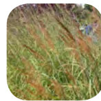
Sorghastrum nutans - Indiangrass September-February. Erosion control.

z: 5 h: 2'-3' s: 1.5'-2' ☀️ ☀️ ☀️ ☀️ 🌱 💧