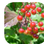
Viburnum trilobum - American Cranberry April-June.