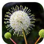
Cephalanthus occidentalis - Buttonbush June. Erosion control.