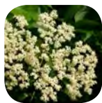
Sambucus canadensis - Elderberry June-July. Low maintenance.