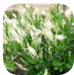
Clethra alnifolia - Summersweet July to August. Fragrant.