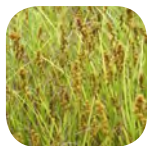
Carex lurida - Lurid Sedge. May-September.

z: 3 h: 1'-2' s: 1'-3' ☀️ ☀️ ☀️ ☀️ 🌱 💧 🌸 🏠