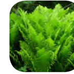
Matteuccia struthiopteris - Ostrich Fern Tolerates clay soils. Fiddleheads.

z: 3 h: 1'-3' s: .5'-2' ☀️ ☀️ ☀️ ☀️ 🌱 🦌 💧