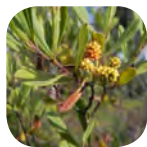
Myrica gale - Sweetgale. July-September. Fragrant. Shorelines.