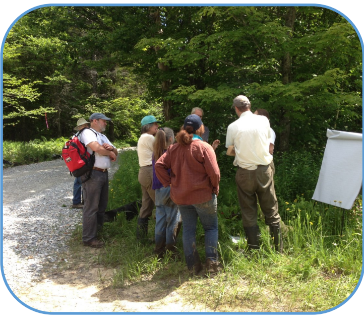
Volunteers learn the basics of plant ID