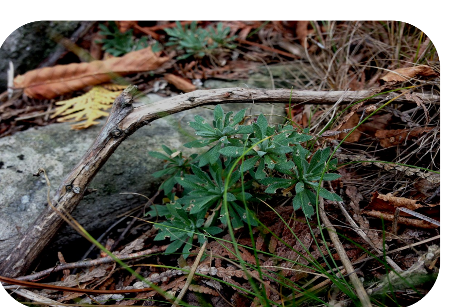
Rare plant Draba -protected by Strike team