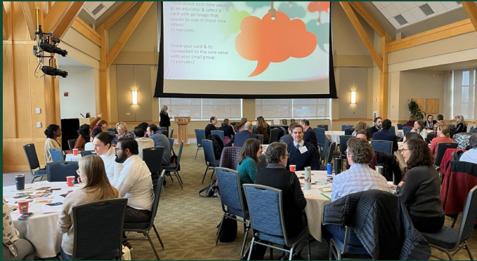
Snow Season Education Retreat