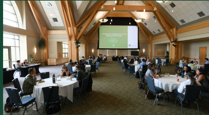
Essentials of Teaching and Assessment