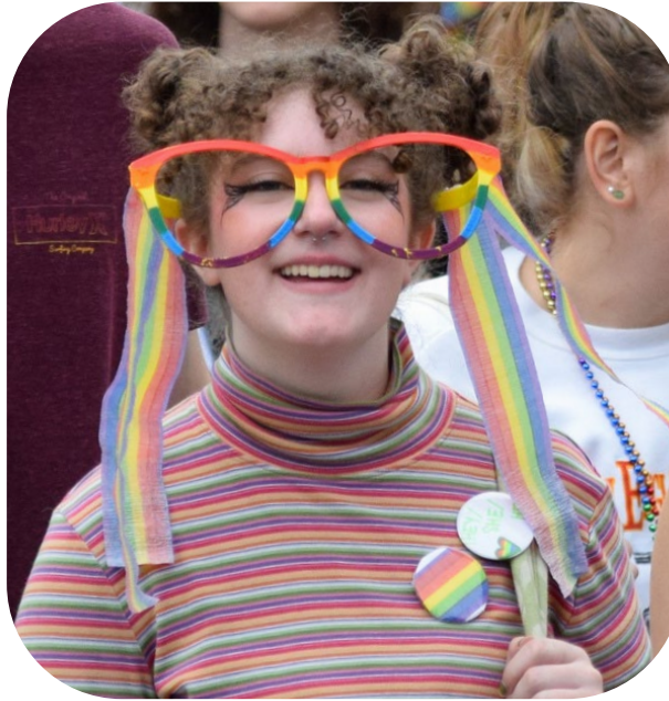
VT Pride Parade & Festival September 8