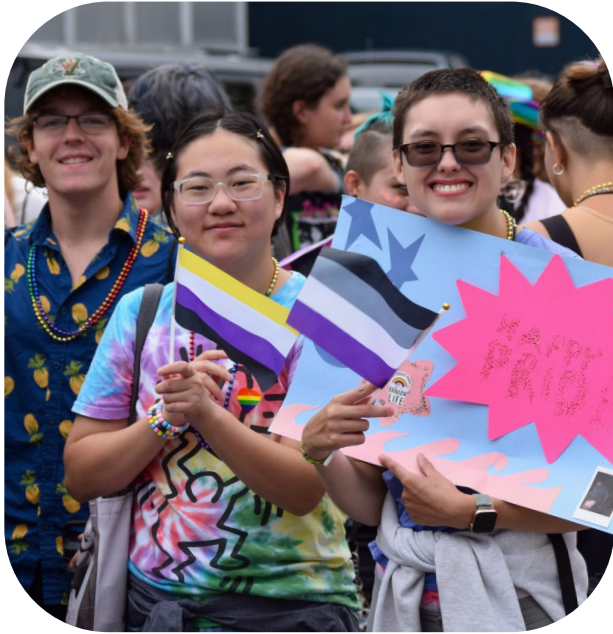
Everyone is Welcome Party September 5