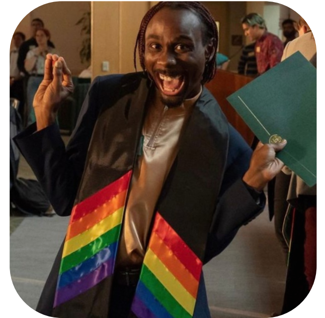
Rainbow Graduation May 2025