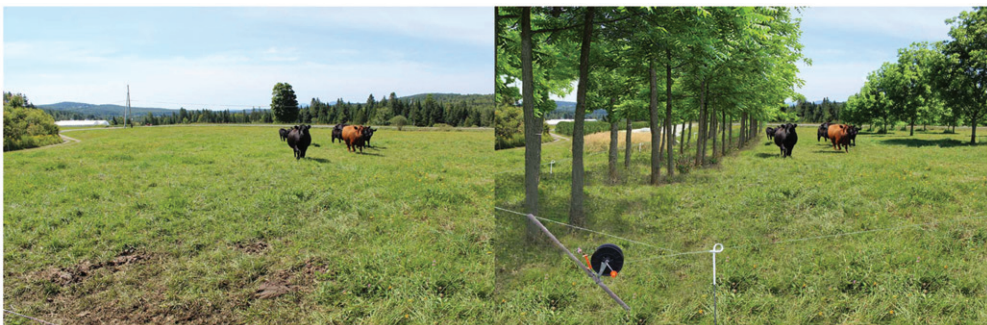
Figure 1. Photovisualization depicting silvopasture.

During the focus groups, the PVZs were displayed around the rooms in which the focus groups were held, and sent by email to remote/telephone phone participants to review simultaneously. A semi-structured focus group instrument was used to capture the in-depth perspectives of participants. Each focus group lasted between 1.5 and 2 h. Audio recordings were made of the focus groups, and later manually transcribed.