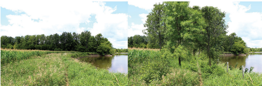
Figure 2. Photovisualization depicting riparian buffers (Schattman et al. 2014).

Results from the focus groups show that participants’ perceptions of climate change adaptation practices were changed in response to the images represented by the