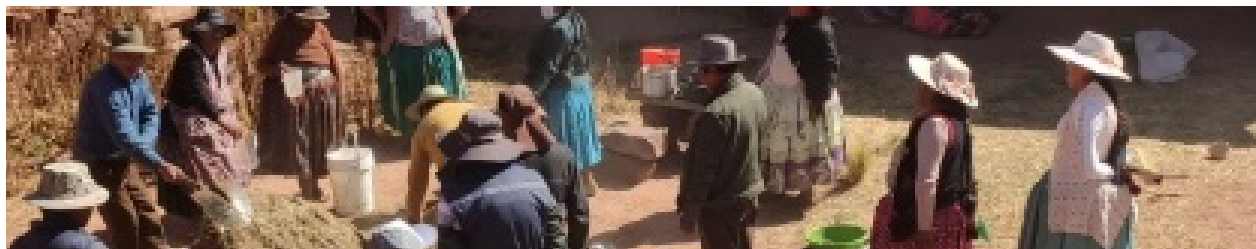
Image 4: Communal bokashi making in Villa Anta. (2023).

Incorporating collective action into agroecology transitions offers new opportunities to support autonomous community transformations. In the selected communities, community action was key to agroecological transitions, facilitated by PROSUCO through a participatory approach. Communities identified priorities, such as improving soils and water resources, promoting the production of bio-inputs, and expanding their changes with the diversification of activities. Using the UVM Institute for Agroecology's transition framework allowed us to define goals and align around a common understanding of agroecology. The transition processes that took place in these communities also highlighted the importance of strengthening collective action joined to Andean traditional norms, such as ayni . Agroecological transitions are not linear or uniform, but complex processes that require adaptability and continuous learning from the perspective of communities. The lessons learned emphasize the need to address agroecological transitions with transdisciplinary approaches based on local values, fostering coalitions, prioritizing the collective, and – in this context – promoting Andean cosmovision. Participatory research is valuable for understanding the context, defining goals and strategies, and analyzing learnings to achieve effective and sustainable transitions.