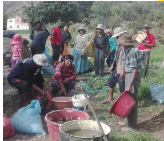
Image 1: Making sulpho-calcium broth in Chives.

- Interview with a farmer in Cebollullo, 2023