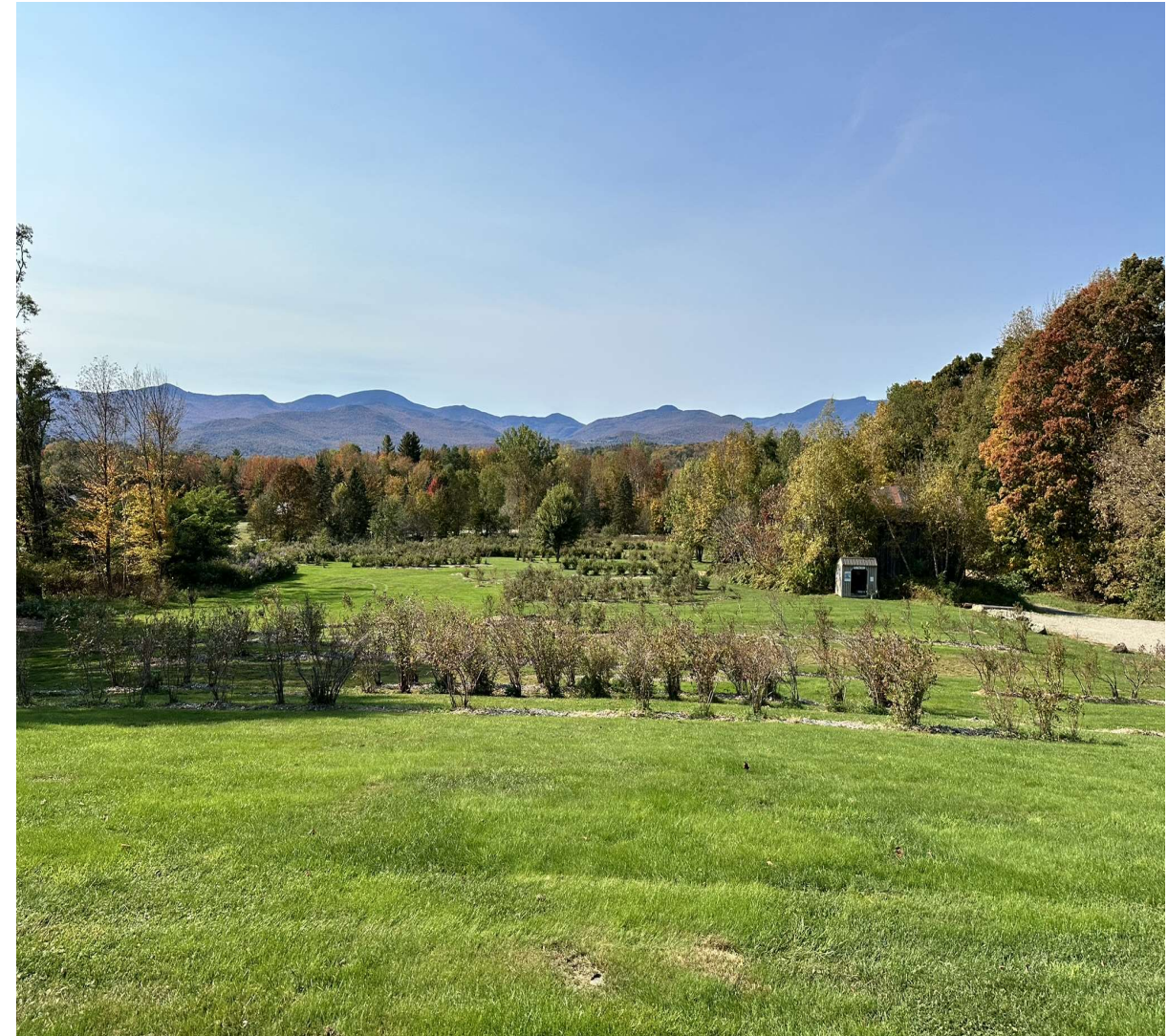
After Fall 2024