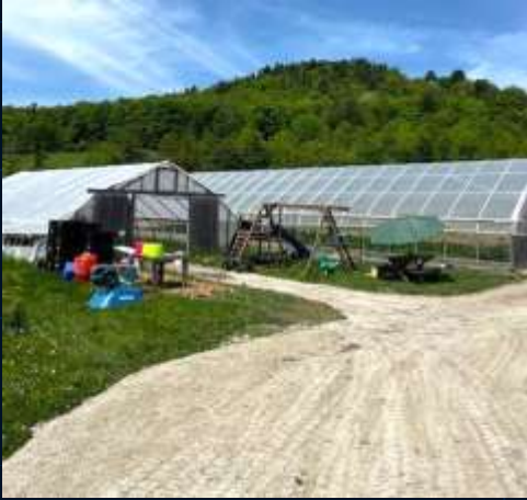
EXCAVATION Drainage. Gravel road. Parking lot at farmstand.