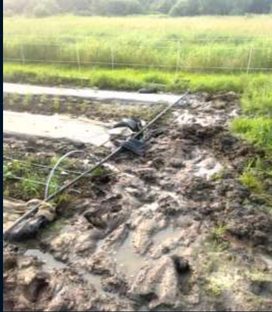
DELUGES Unprecedented rain. Big losses.