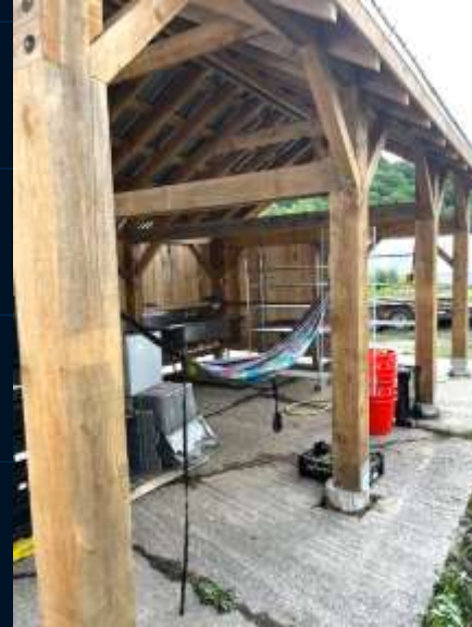
PACKSHED VT Family Farmer of the Month award (NOFA)