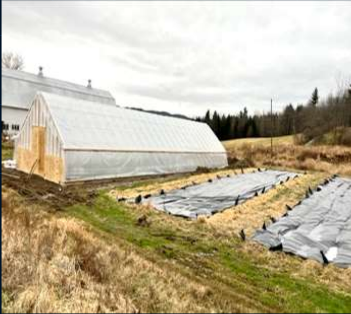
30' x 96' LEDGEWOOD Built it ourselves over an existing block.