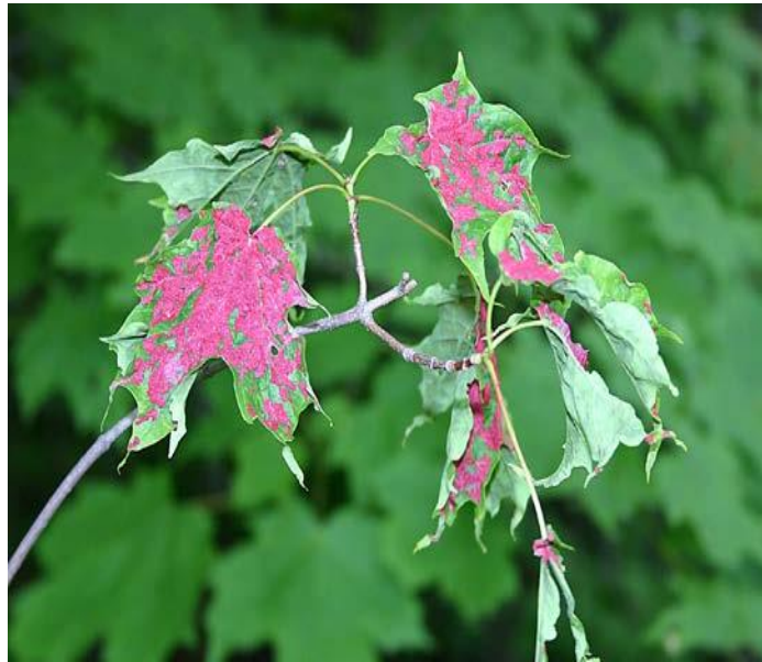
Ohio State University

Maple Anthracnose- Fungal disease common in cool wet springs. Also attacks ash, white oak, sycamore. Damage often follows the leaf veins/ may cause defoliation. No control warranted. https://www.ppdl.purdue.edu/PPDL/weeklypics/5-25-09.html