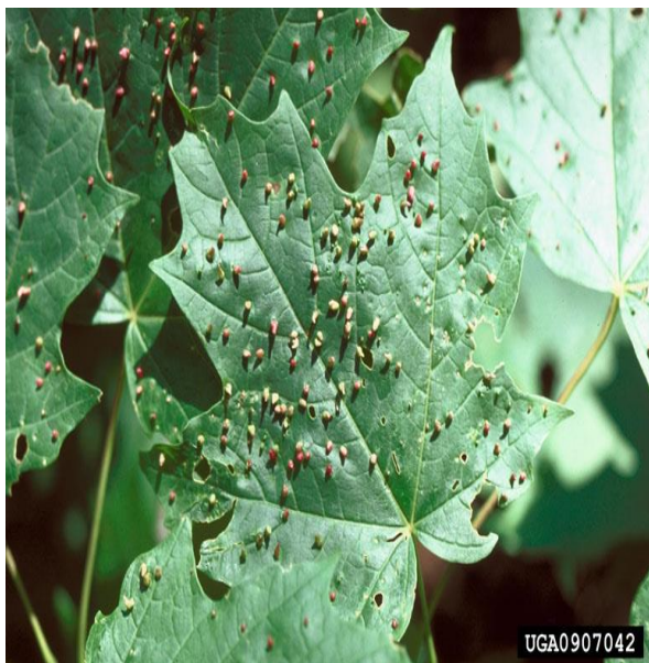
Ronald S. Kelley

Maple Gall and Erineum mite- Interesting little spider-like creature whose feeding creates these raised galls/pink felt-like damage. No control warranted. More info at http://ento.psu.edu/extension/factsheets/leaf-galls-maple http://ohioline.osu.edu/factsheet/ENT-60