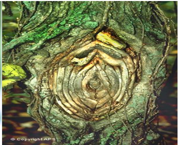
American Phytopathological Society