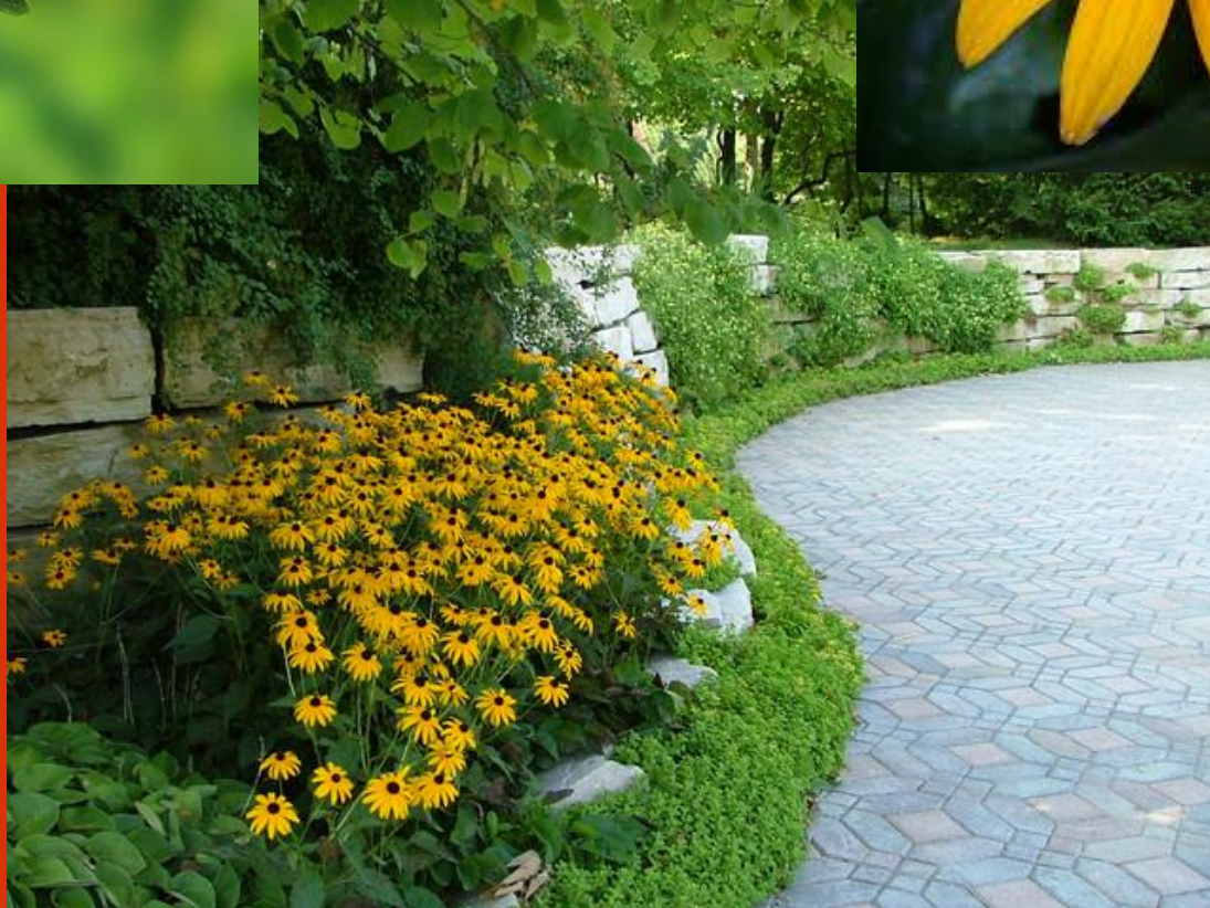
Black Eyed Susan