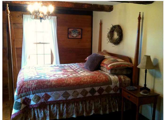
Bedroom at Vermont Grand View Farm, Washington, VT. Grand View offers overnight stays and retreats on a historic hillside sheep farm. (Vera Simon-Nobes)

It is important to plan the look of your farm stay lodgings and to be thoughtful about its furnishings. Consider how the interior and exterior of your accommodations can honor the traditions of your landscape. Will you tout the “well-appointed guest house with fully equipped kitchen, high-speed Internet access, cellphone reception, satellite TV,” like the Sweet Retreat Guesthouse and Sugarworks in Northfield, VT? Or the “garden views, cottage-style furnishings, queen bed, and hand-stenciled walls,” like Crescent Bay Bed and Breakfast in South Hero, VT?