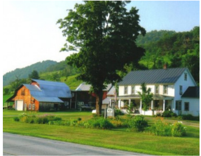
Devil's Den Farm and B&B, Chelsea, VT.

“ I have a set script for speaking to new arrivals. I speak slowly and clearly when describing the layout of the house, their room features, our breakfast time, entrances, and parking. Guests coming into a new place sometimes get confused so being very clear helps to set them at ease.”