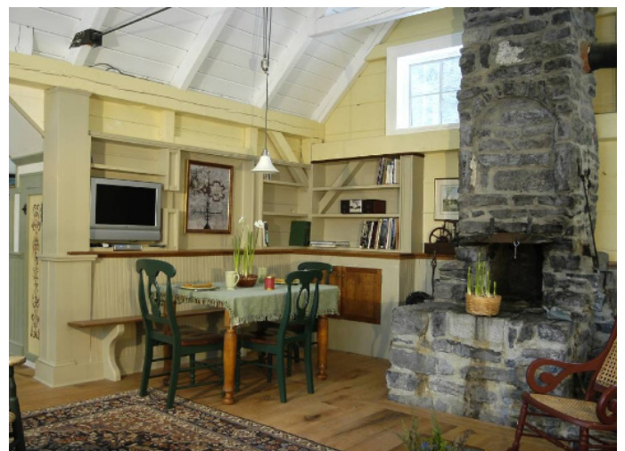
Dining area at Breidablick Cottage, a former blacksmith shop on Windekind Farm in Huntington, VT. (John Hadden)