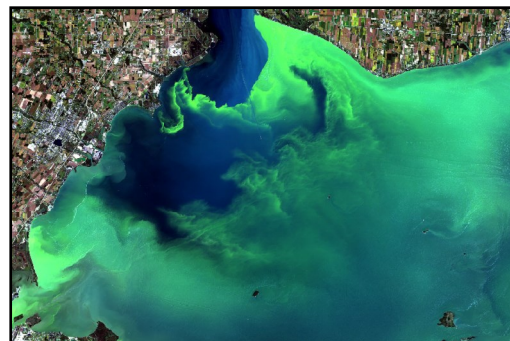
Algal bloom in Lake Erie, 2017.

In agriculture, this nutrient pollution can be controlled by implementing and improving practices that reduce runoff, such as building good soil structure and not over-fertilizing nitrogen and phosphorus using slow release fertilizers.