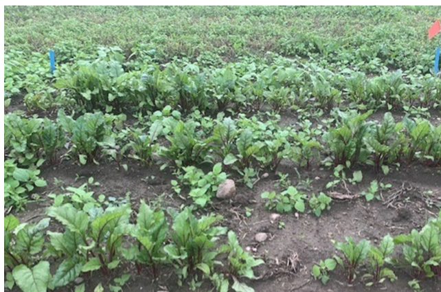
Field trials and crop growth.