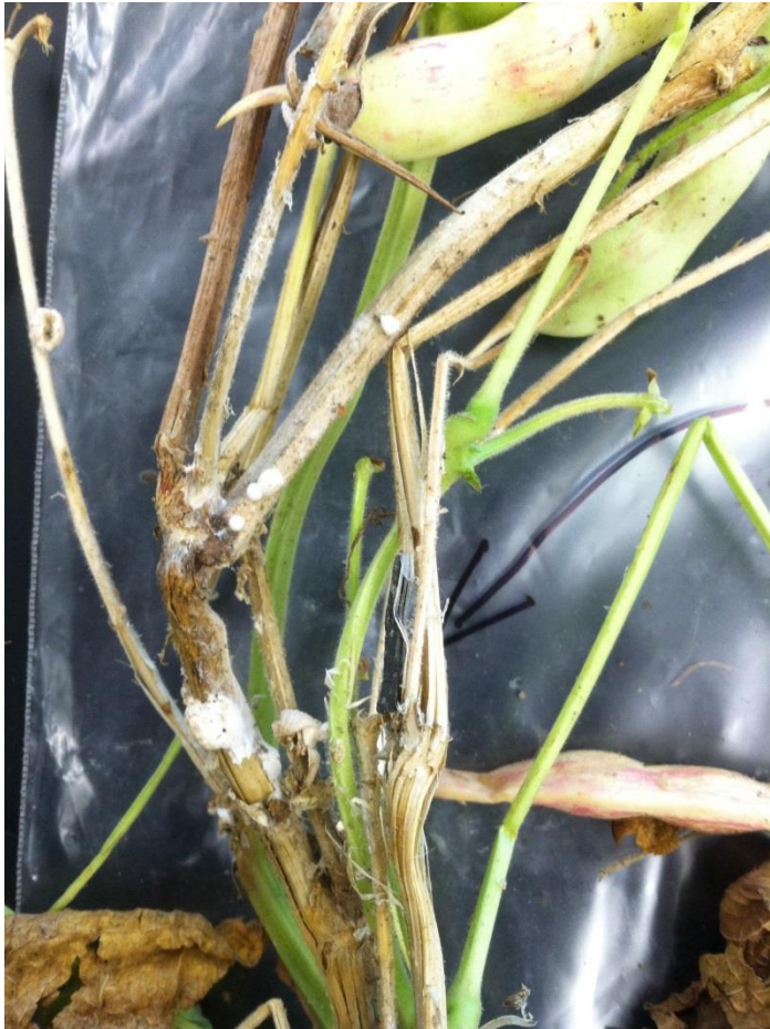
Sclerotinia (white mold)