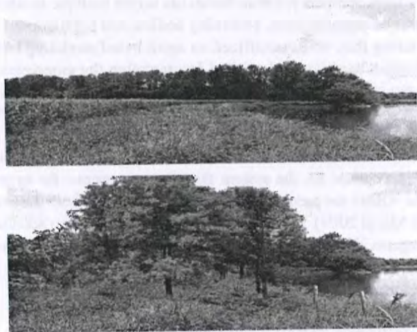
Figure 16.3 (See color insert) Photograph of an existing cornfield on a riverbank ( top ) and the proposed condition with riparian buffer ( bottom ).