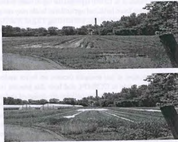
Figure 16.2 (See color insert) Photograph of existing vegetable field in a floodplain ( top ) and the proposed condition with hoop houses, crop diversification, and wetlands ( bottom ).

adoption of CCBMPs at both the farm and landscape levels. Both eye-level and orthophoto (map-view) images of photo-realistic landscapes are presented to stakeholder groups to both demonstrate the spatial and visual effects of CCBMP implementation and gauge the utility of this form of imagery within PAR processes. Figures 16.2 and 16.3 show examples of the type of “existing versus proposed” landscape views that we are developing to share with stakeholders. This type of visualization has been increasingly employed in the environmental planning field as a means to communicate the distinctions between different policy, land use, and land management scenarios. Landscape visualizations have become an increasingly important component of environmental decision making and public participation processes, including in natural resource management studies (Pettit et al. 2011), in rural landscape settings (Appleton and Lovett 2003), and in public dialogues about visualizing the impacts associated with climate change (Sheppard and Meitner 2005; Sheppard et al. 2011). Landscape visualizations complement other forms of communication and have been found to be