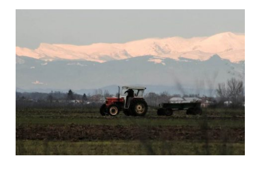
Farm Safety Check: Towing

February 2022 Winter and spring can be tough seasons for towing, with conditions including snow, ice and mud. Towing can be dangerous in a number of ways,