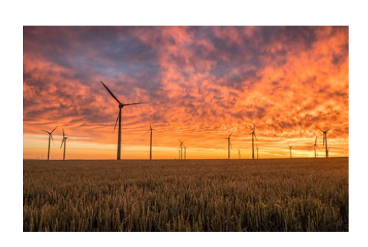
Farm Safety Check: Working Alone

First aid kits should be a staple on farms, and readily available. Farming is a dangerous occupation. Having a well stocked first aid kit can help you