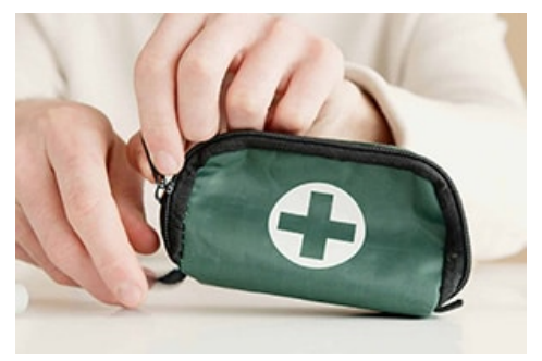
Farm Safety Check: Farm First Aid

NOVEMBER 2021 Harvest is a busy time for many farms. As cooler temperatures replace summer heat, crops begin to dry down rapidly, increasing risk for dangerous