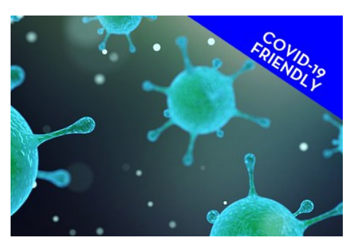
Farm Safety Check: Antimicrobial Resistance