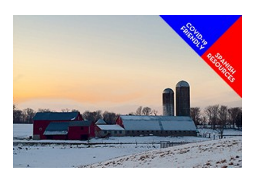
Farm Safety Check: Working in the Cold