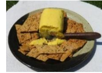
Saffron soft cheese: a promising value-added product.

https://www.youtube.com/watch?v=YZTMQEzy9ok&list=PLBDy4IUFNEtwcG4I3ZV2yNPBfqdDqyWdG&index=3