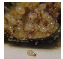
Bulb mites feeding.