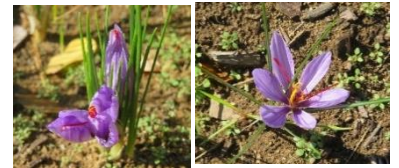
Saffron flower development stages.