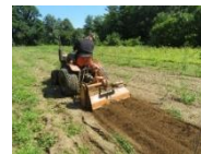
Rototilling over saffron bed to remove weeds.

https://www.youtube.com/watch?v=eesMmypiT_0&list=PLBDy4IUFNEtwcG4I3ZV2yNPBfqdDqyWdG&index=2