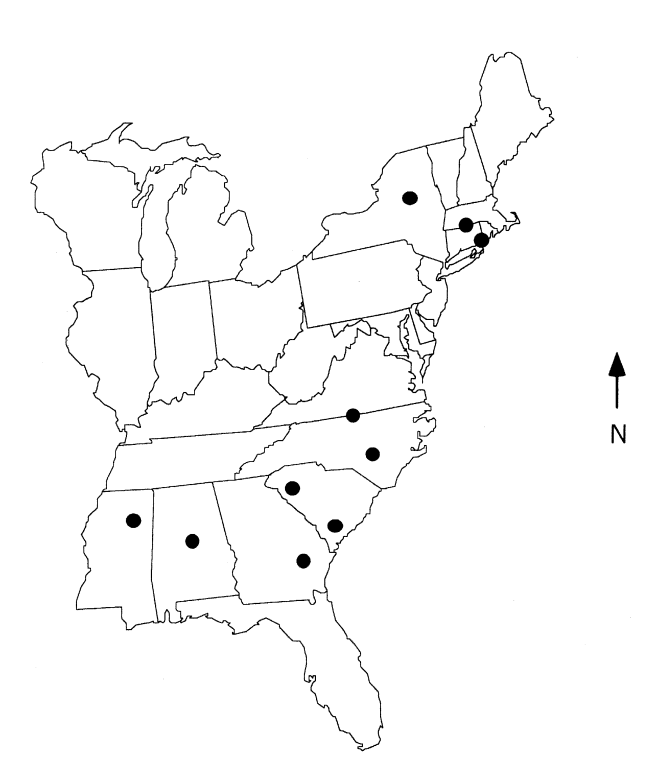
Fig. 1. Locations of the 10 Myrmeleon immaculatus populations used in the starvation resistance experiment.

In 1995, third-instar M. immaculatus larvae were collected from 10 populations ranging from Mississippi to New York (Fig. 1). Collecting began in Mississippi on 14 July and finished in New York on 7 August (Table 1). The latitude and longitude of each site were measured using a Magellan Global Positioning System Instrument (Thales Navigation, Santa Clara, California). Elevation was calculated with United States Geological Survey topographic maps. The habitat at each site consisted of sandy, loose soil located under a shelter such as a cliff edge or bridge. At each site, \approx 30 thirdinstar larvae were collected randomly, placed individually in