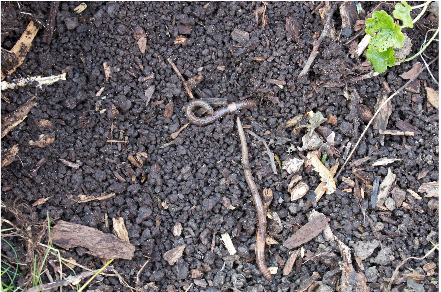
Invasive jumping worms degrade topsoil by processing leaf litter, mulch or other organic matter rapidly, leaving behind a distinctive soil signature often described as resembling coffee grounds, which disrupts the soil food web.

Their diversity-reducing effects have been documented on forest trees and the herbaceous layer below, which fail to flourish and regenerate. Soil-dwelling organisms like millipedes decline; salamanders and ground-nesting birds suffer. At the arboretum in Madison, the jumping worms are already displacing other earthworms.