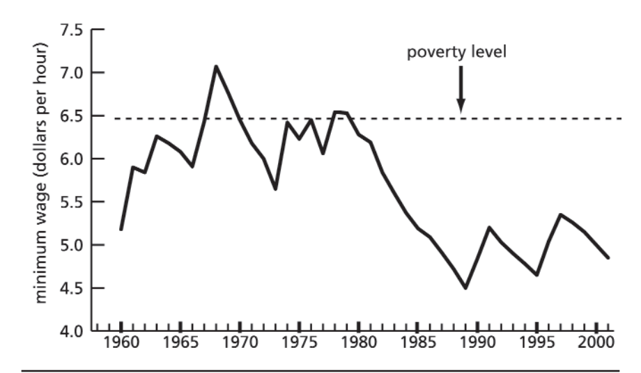
Chart 3: Minimum Wage in 1999 Dollars and Poverty Level for Family of 3 (assuming earning minimum wage for 52 weeks at 40 hours per week)