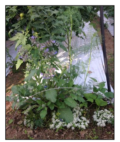
Habitat plants in tomatoes.

http://www.uvm.edu/~entlab/Other%20Research/Saffron/Saffron.html