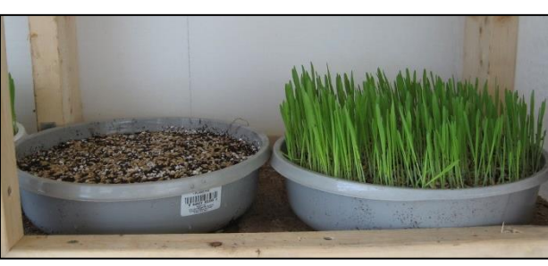
Production of aphid banker plants. Seeds spread on soil surface (left), barley 1 week after planting (right). These starter plants must be covered with a hairnet or kept in a screened cage at all times to keep parasites out.

6. Place an order to receive 500 A. colemani each week for 3-4 weeks, with the first shipment to arrive the following week ( Week 2 ). They are shipped in a tube of parasitized aphid mummies in vermiculite.