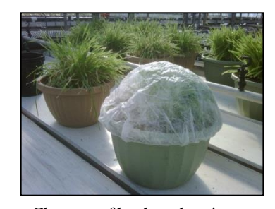
Close-up of banker plant in pot covered with hairnet.