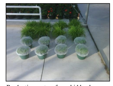
Production system for aphid banker plants. Plants from Wk 3 and 4 are covered with hairnets, Wk 1 and 2 and are uncovered to allow parasites to disperse into the crop.