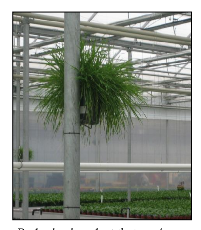
Barley banker plant that produces parasites to manage aphids.

Several species of aphids attack ornamentals, greenhouse grown vegetables and spring bedding plants. Some can be managed effectively with parasitic wasps using an Aphid Banker Plant System. Banker plants are a self-contained sustainable system that supplies a non-pest prey species to support a continual source of natural enemies that disperse into the crop in search of other pests. Essentially they are a mini-rearing system for the natural enemy. The prey may be a plant pest, but not of