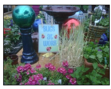
Aphid banker plant in a retail area with a customer awareness sign.

Monocotyledon plants, including Easter lilies, Alstroemria, ornamental grasses, orchids, day lilies, irises, spring bulbs (tulips, daffodils), palms, sweet corn, onions and garlic. Research in Canada has shown that if less than 10% of the crop in a greenhouse is a plant that could be susceptible to the bird cherry oat aphid, it is unlikely that they will infest your crop.