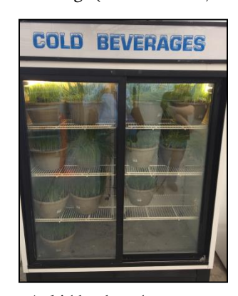
Aphid banker plants grown in a modified soda cooler.