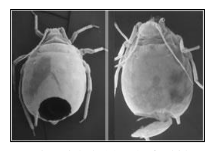
Parasite exit hole (above) of aphid mummy. Note that the hole is a perfect circle. The exit hole of a hyperparasite is jagged and has uneven edges (below).