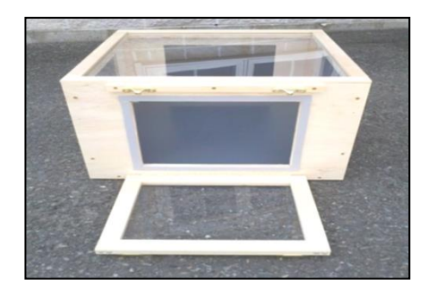
Aphid Banker Cage (Pristine Plants, LLC)