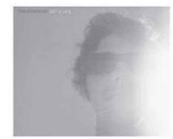
The Crack Up - Get A Life

But what we think really makes the band click is the honesty found in their songs. The lyrics and the instrumentation mesh in a way that betrays not just writing skill, but musical maturity, and patience and experience in the practice room. Think Wilco, in this aspect. The result is an emotional candor that made us (amateur music critics who might not normally get into this particularly emotional brand of Indie) forget about genre and consider what the songs themselves say. Whether or not this type of music is your bag, there is something going on here that is most definitely worth being heard. That's why The Crack Up is UVM's Best Band.