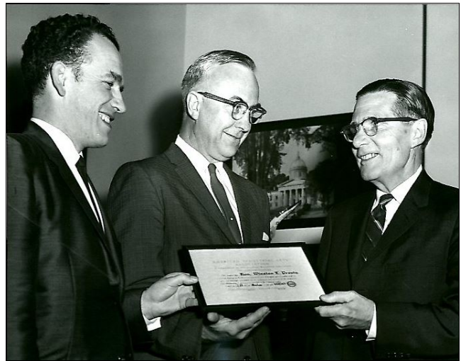
Above: The American Industrial Arts Association recognized Senator Winston Prouty for sponsoring a program of Federal Assistance to Industrial Arts Education.