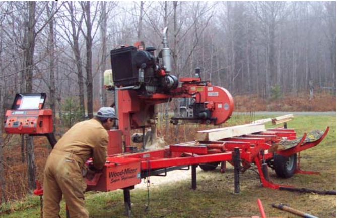
What lies beneath the bark? Leo Boutin will cut logs for viewing on Saturday at workshop F.

F. Discussion of woods management and practice choosing trees for removal with Chittenden County Forester Michael Snyder; plus, viewing and discussion of logs on a landing to be sorted into pulp, firewood and sawlogs with Tommy Lathrop of Lathrop lumber; plus, demonstration of a portable mill which will cut up some of the logs to reveal defects within, and discussion of specialty wood markets; plus, demonstration of a firewood processor.