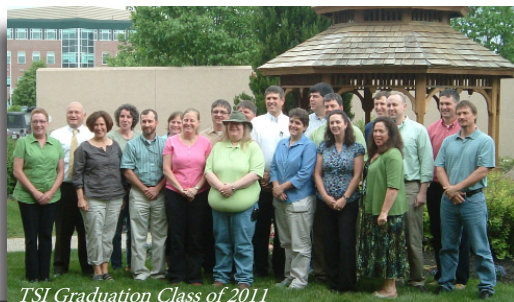
TSI Graduation Class of 2011

Participants from each of the states above selected a project. In Vermont this included human resource development initiatives that seek solutions for burn-out prevention for leadership at all levels; worker retention strategies; increased support for employees; meaningful recognition of good work; and planning for strategic investments in training.