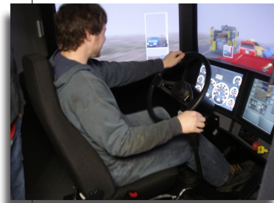
A CDL simulator gives students hands-on experience.

The challenges of designing and maintaining a transportation system to meet the needs of the coming decades requires a skilled, motivated and sustainable workforce. TEDPP at the UVM TRC is addressing that challenge in Northern New England and creating lessons and resources to be used nationally.