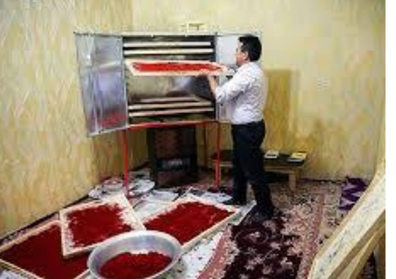
Drying by heater(farmers house)