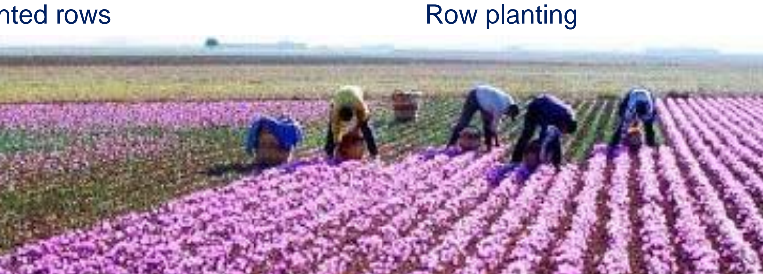
Saffron field planted by automatic planter

Saffron irrigation begins in late September or October. Usually saffron fields are irrigated 5 times a year. In the cold regions, the first irrigation is in the end of September or early October. After this irrigation it is very important to break the soil crust and control weeds, particularly when sprinkler or basin irrigation is used. Saffron begins flowering three weeks after the first irrigation.