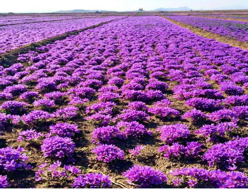
Bunch planted field