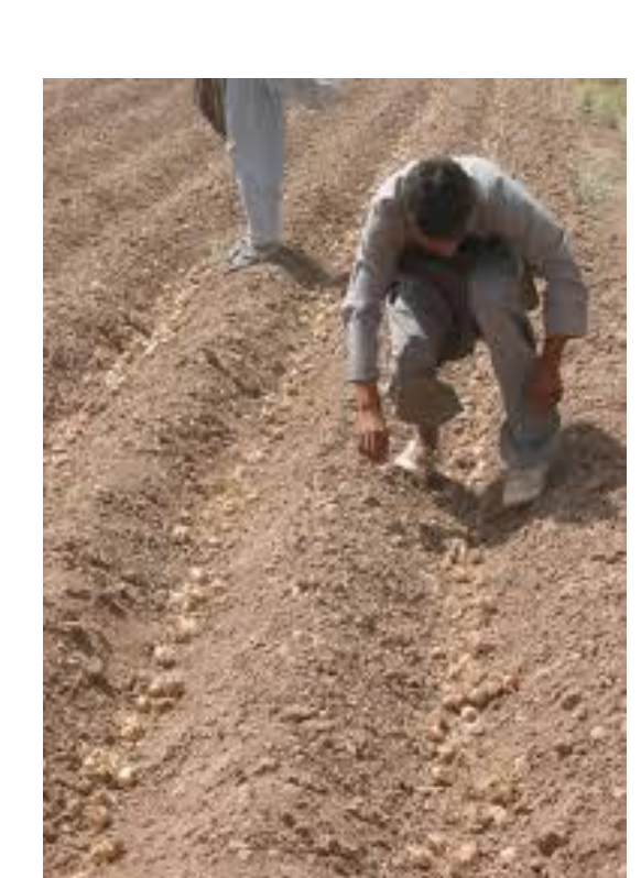
Hand row planting