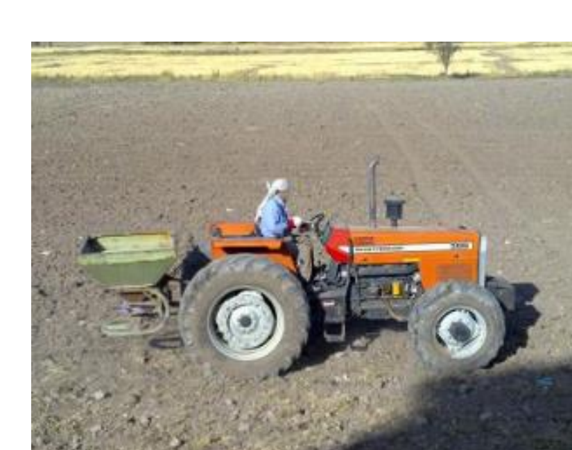
Animal manure distribution Fertilizer distribution

Planting method and corm spacing depend on the irrigation method. In dry zones with limited water where basin irrigation is used, saffron is planted by hand in holes dug with a shovel. The usual spacing is 30-25 cm between holes and the depth of cultivation is at least 25 - 20 cm, with multiple corms in each hole. While this method requires little equipment, the field must be weeded by hand and will be slower to harvest than if saffron is planted in rows.