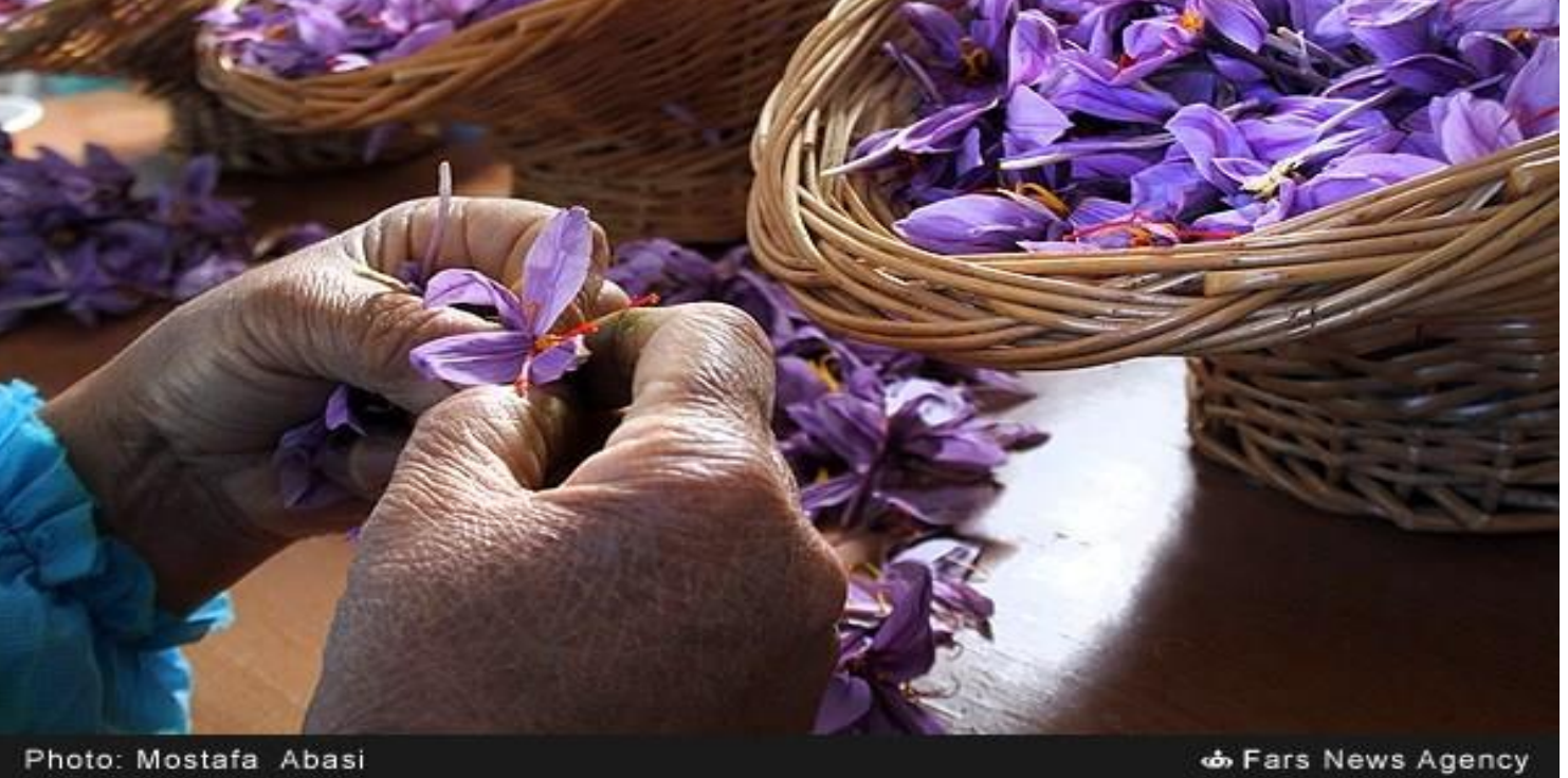
Conventional sorting method in farmer's houses