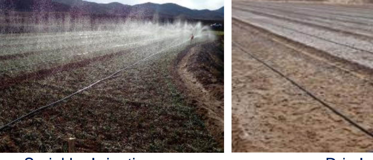
Drip Irrigation Sprinkler Irrigation

In a saffron farm two or three crucial steps of weeding are necessary. The first and second weeding are done after harvesting and in March to eliminate winter weeds. The final weeding is done after the first irrigation and before flowering of saffron in fall. Winter weeding is usually done by hand, and if the farm is not organic, farmers use selective herbicides. Summer or fall weeding are usually done mechanically. To keep the corms at a constant depth, farmers usually spread about 5 cm of soil on the field after the fall weeding.