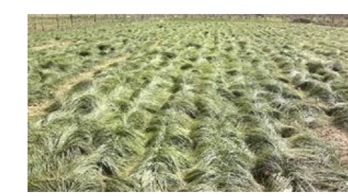
Saffron field at end of March Field after harvest and before weeding

Harvested flowers should be processed to separate the stigmas from the flower and dry the stigmas. Farmers may process their own saffron, or send the harvested flowers to a processing facility.