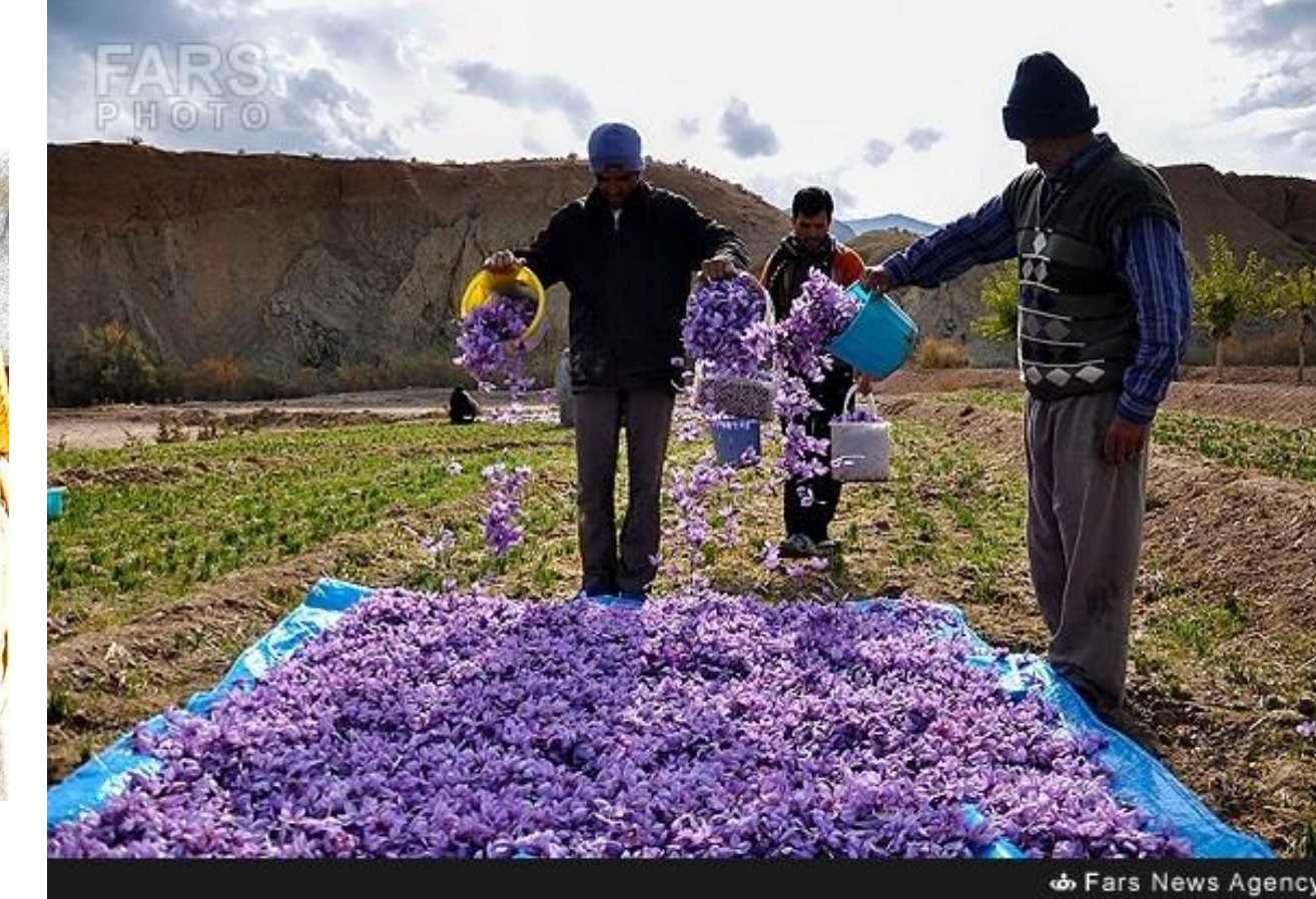
Transporting the harvest