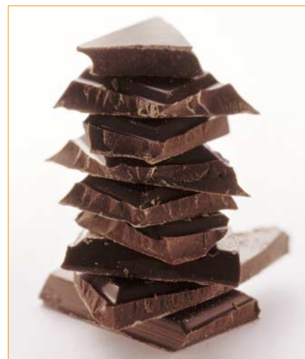
Figure 1 Stack of benefits? Unlike its milky counterpart, dark chocolate may provide more than just a treat for the tastebuds.

Addition of milk, either during ingestion or in the manufacturing process, therefore inhibits the in vivo antioxidant activity of chocolate and the absorption into the bloodstream of (–)epicatechin. This inhibition