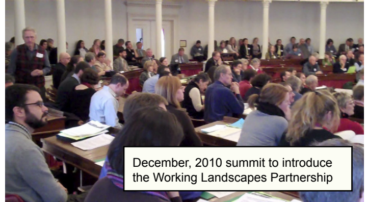
December, 2010 summit to introduce the Working Landscapes Partnership