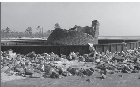
The remains of Round Island Lighthouse, off the coast of Pascagoula, Mississippi, after Hurricane Katrina.