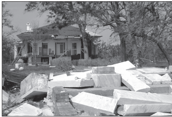
Beauvoir, the NHL home of Jefferson Davis, suffered substantial damage during Hurricane Katrina.

Because of the large scale of damage hurricanes leave behind, the recovery work is split into many different pieces that can be accomplished in steps. Ciampolillo has spent the last two years assembling a draft of the historic context of one of the seven gulf counties in Mississippi, compiling a statement of the historic significance of the many historic resources in the