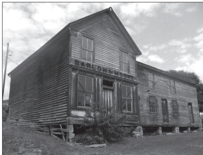
Barlow & Moore General Store, Pocahontas County West Virginia. Site Visit where the owner wanted to discuss a potential National Register Nomination and Restoration Techniques. The owner was especially concerned about restoring versus replacing the historic windows.