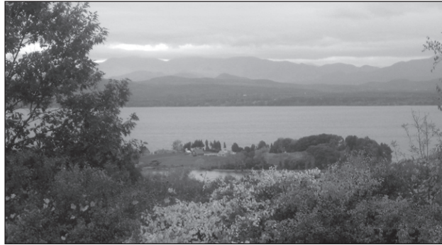
Vernacular landscape, Shelburne, Vermont.

"organically evolved landscape," also referred to as a vernacular landscape. This includes townscapes, farmland or other areas that continue to be used and changed over time; 3) An associative (or ethnographic) landscape, which has strong religious or cultural ties and includes important Native American sites.