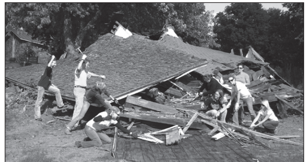
The class on a recent field trip.