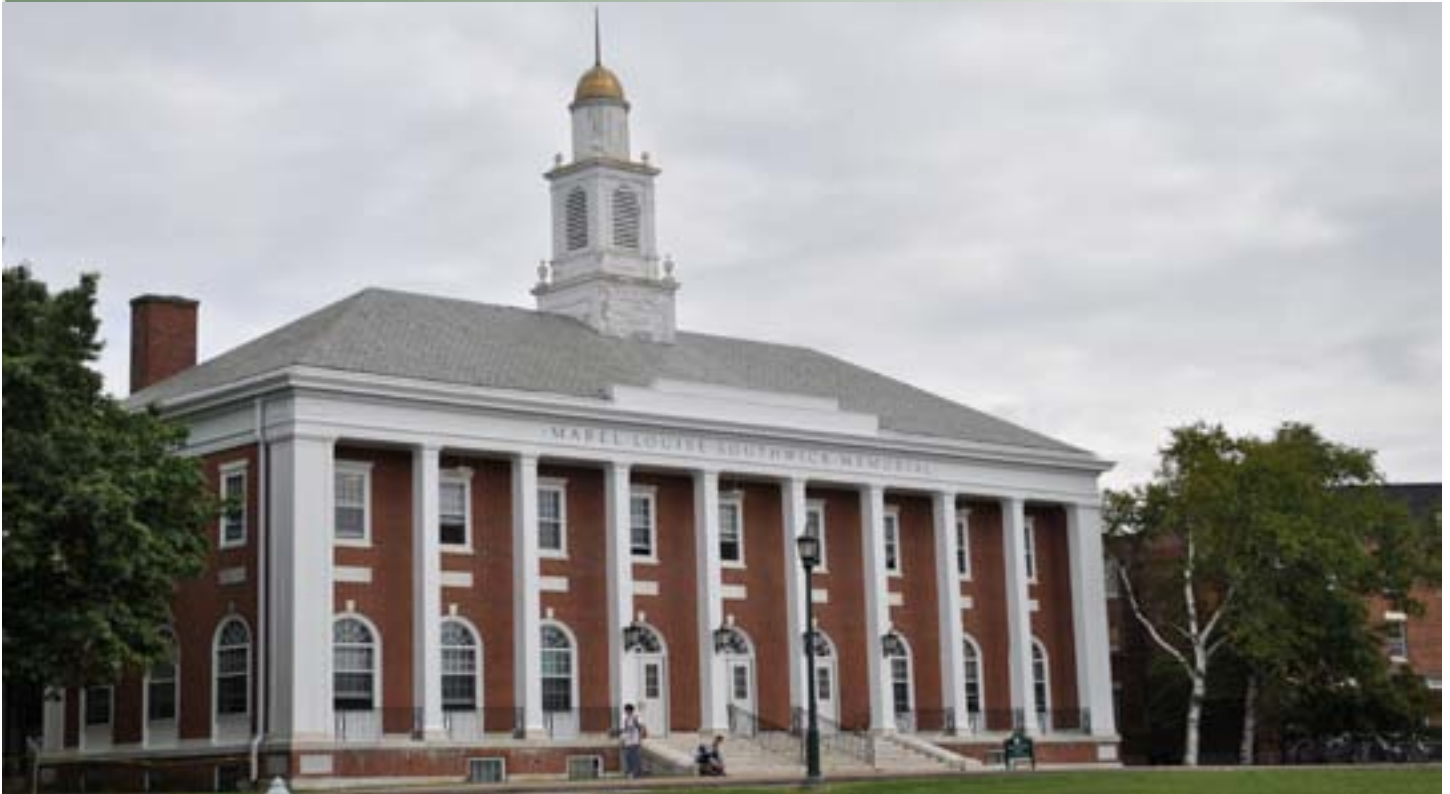
Southwick Hall, located on the Redstone Campus, designed by the architectural firm McKim, Mead, and White in 1934. Maintenance for the building has been an ongoing project at the University of Vermont.