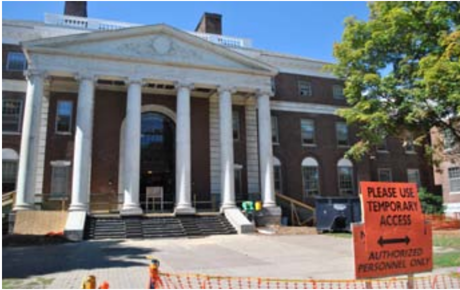
Waterman Memorial Building undergoing improvements to the primary facade.

The University has several maintenance projects underway at Waterman Building. Waterman was built in 1940-41 to the designs of the architectural firm McKim, Mead, and White. Presently, the building's front brass doors and historic lights surrounding these doors are being cleaned and restored. The massive granite entrance steps have been removed due to the deterioration of the