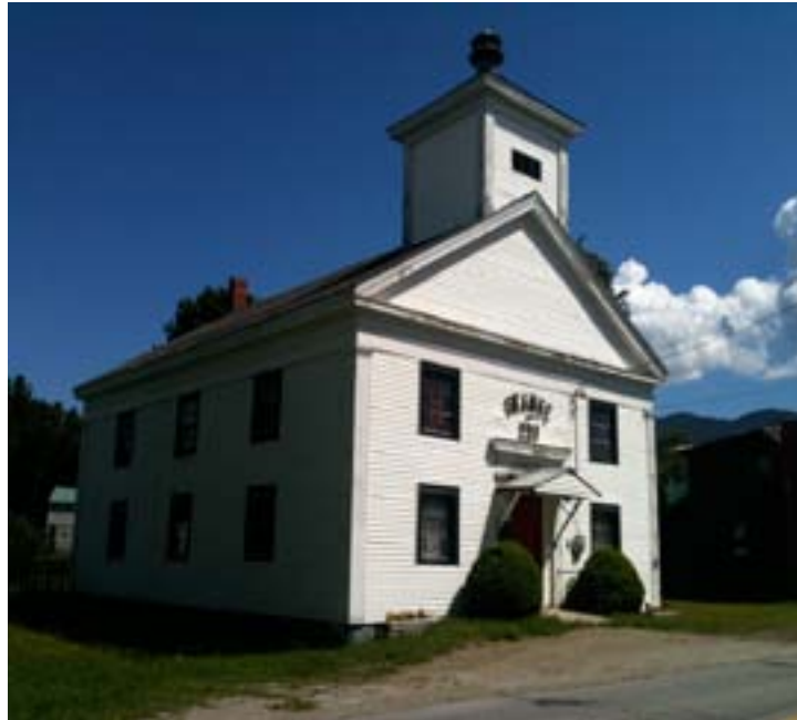
An historic grange in Waterbury Center, Vermont.