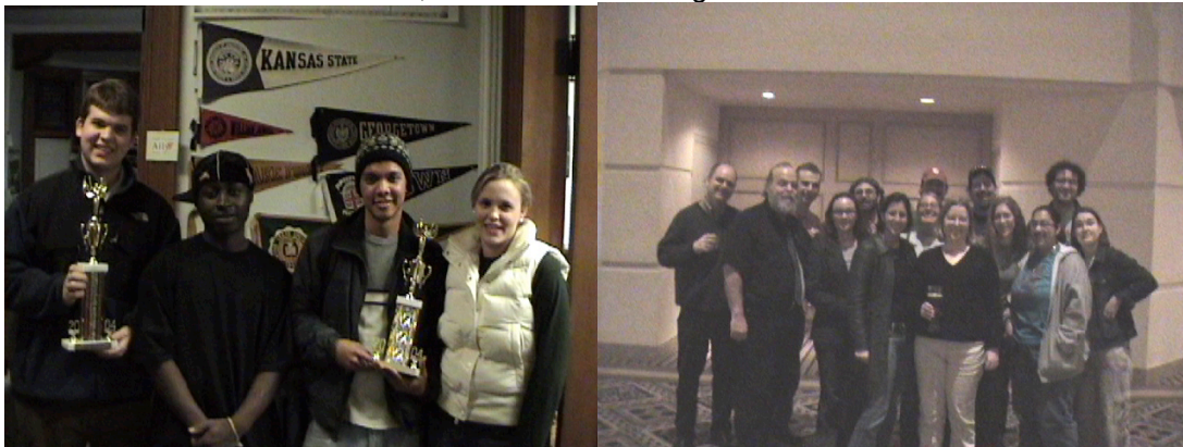
DOUBLE FIRSTS AT ROCHESTER – LDU COACHES PAST & PRESENT

Asian Studies Outreach Program, UVM Burlington High School Corporacion Cultural de lo Barnechea, Chile Cross Examination Debate Association English Speaking Union, UK Free Debate Club of Belgrade, Serbia Inner Mongolia Normal University, China International Debate Education Association Kyung Hee University, Republic of Korea National Forensic League Vermont Debate and Forensic League Vermont Principals Association World Debate Organization Za in Proti, National Debate Program of Slovenia