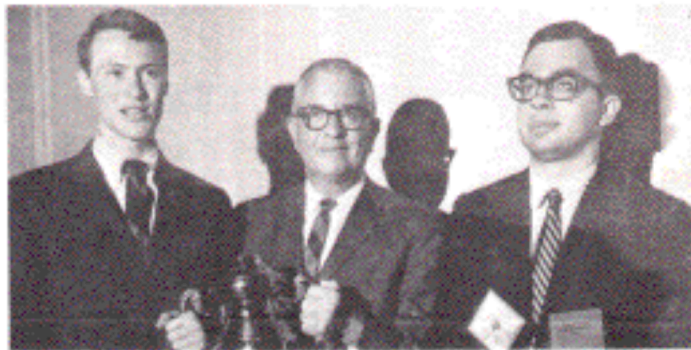
Winning a Delta Sigma Rho-Tau Kappa Alpha Championship (1967)