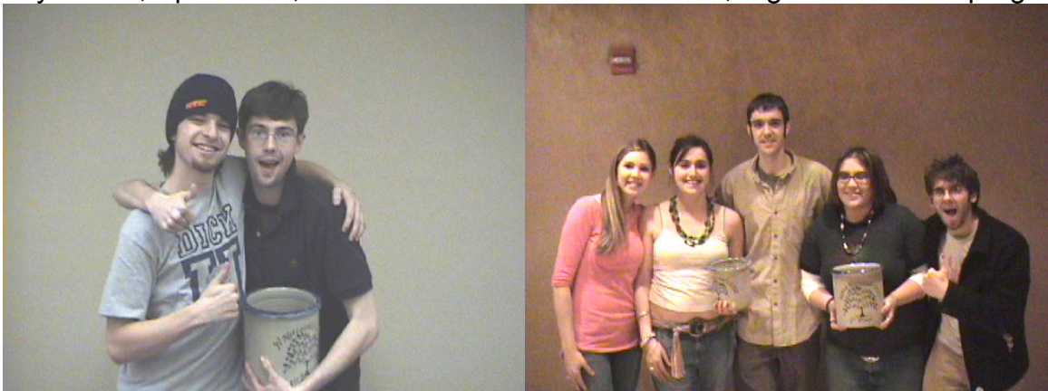
JV NATIONALS CHAMPS – NOVICE NATIONAL CHAMPS

Poetry Slams, Speak Out, Hosted four debate tournaments, regular television program.