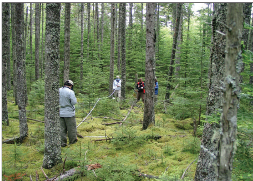
Figure 3. A field crew measures a forested plot at Acadia National Park.

tessellation stratified sampling (GRTS; McDonald 2004). This equal-probability design allows for statistical inference while also providing balanced spatial coverage and flexibility for post-stratification of plots based on ecological system or other criteria, as needed over the long term